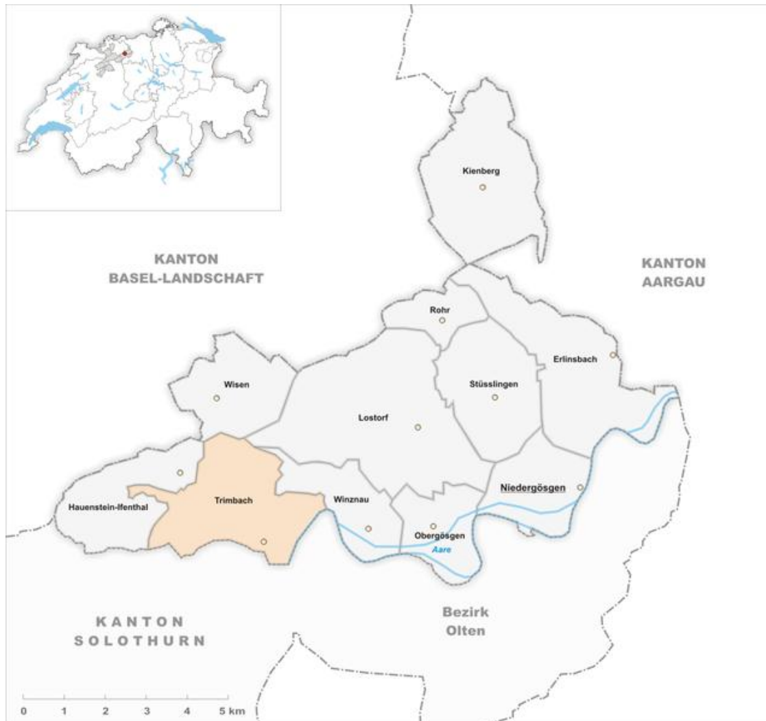
Figure A1: Location of Trimbach

Top left corner shows where Trimbach is located in Switzerland. The main image shows the location at the regional level. Trimbach is part of the canton Solothurn and not far away from the cantons Aargau and Basel-Landschaft.