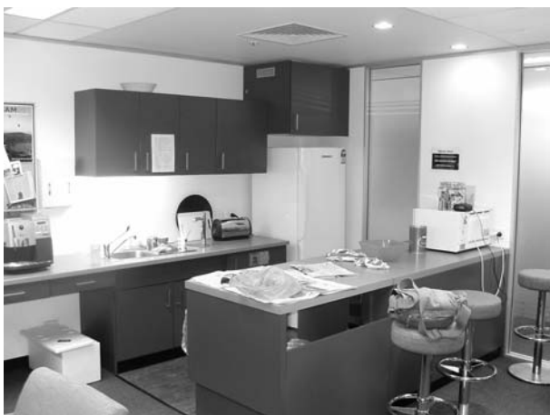
Figure 2: Disorder Condition