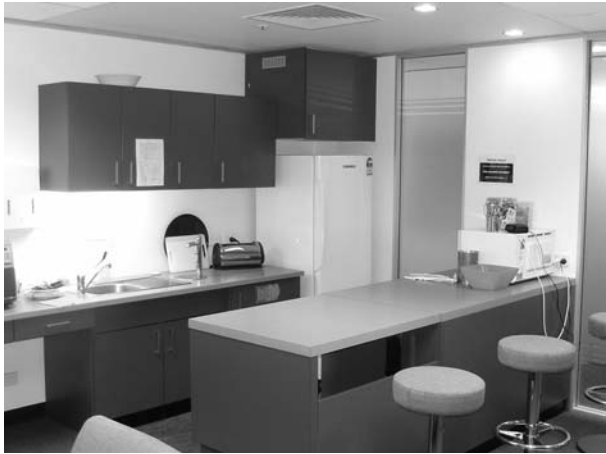
Figure 1: Order condition