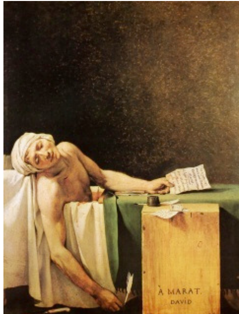
Figure 1 Jacques-Louis David (1748-1825): The murdered Marat

who had been imposed by a foreign power. Famous paintings depict the murder of rulers such as David's "The murdered Marat"(Figure 1).