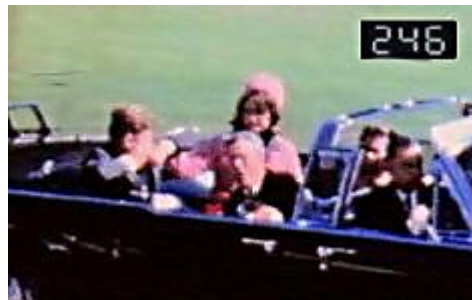
Figure 2 The assassination of President John F. Kennedy