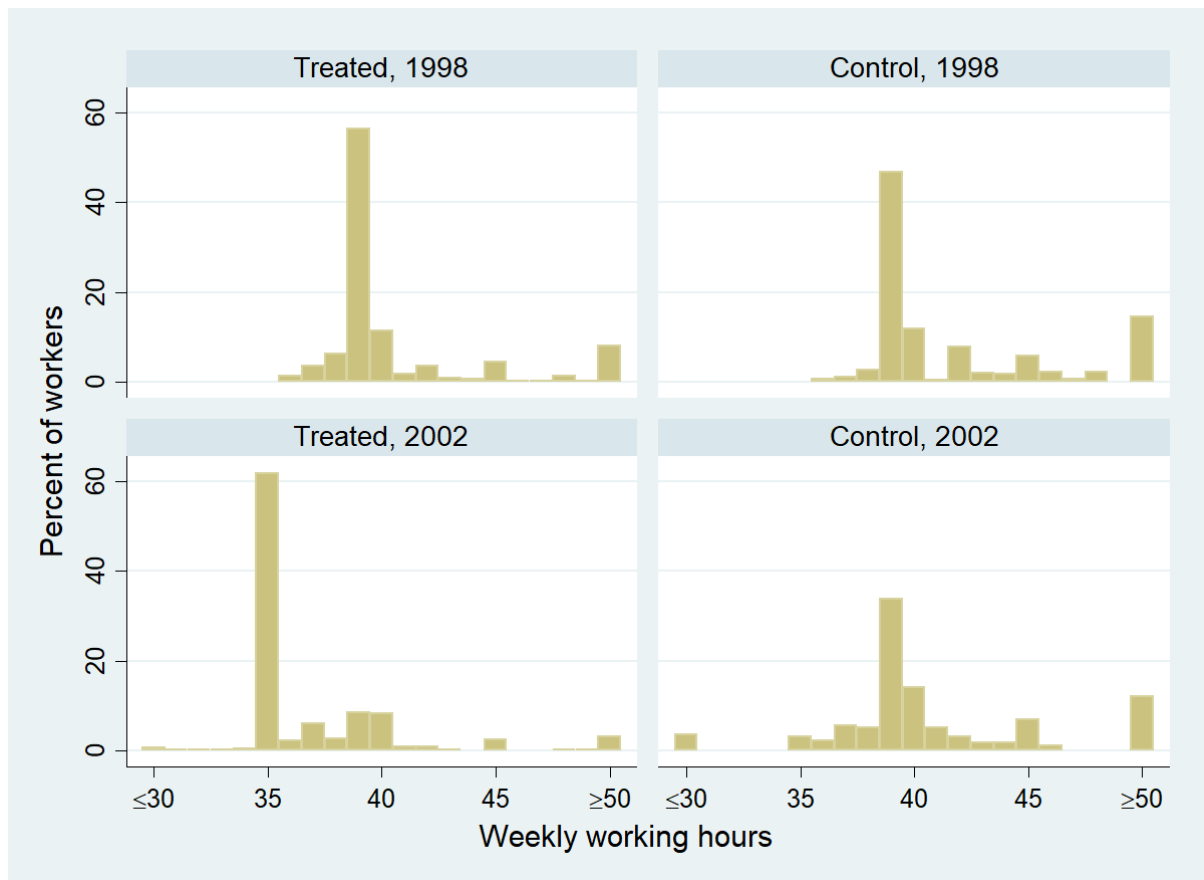
Figure 1 Weekly working hours by treatment status and year