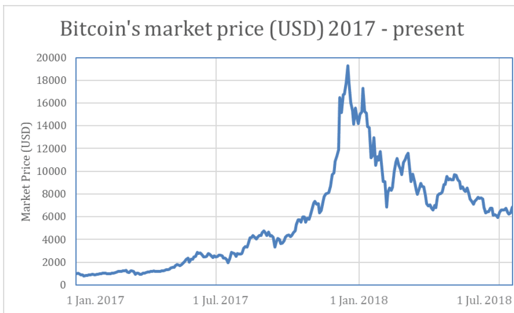
Figure 3: Bitcoin's market price 2017–present