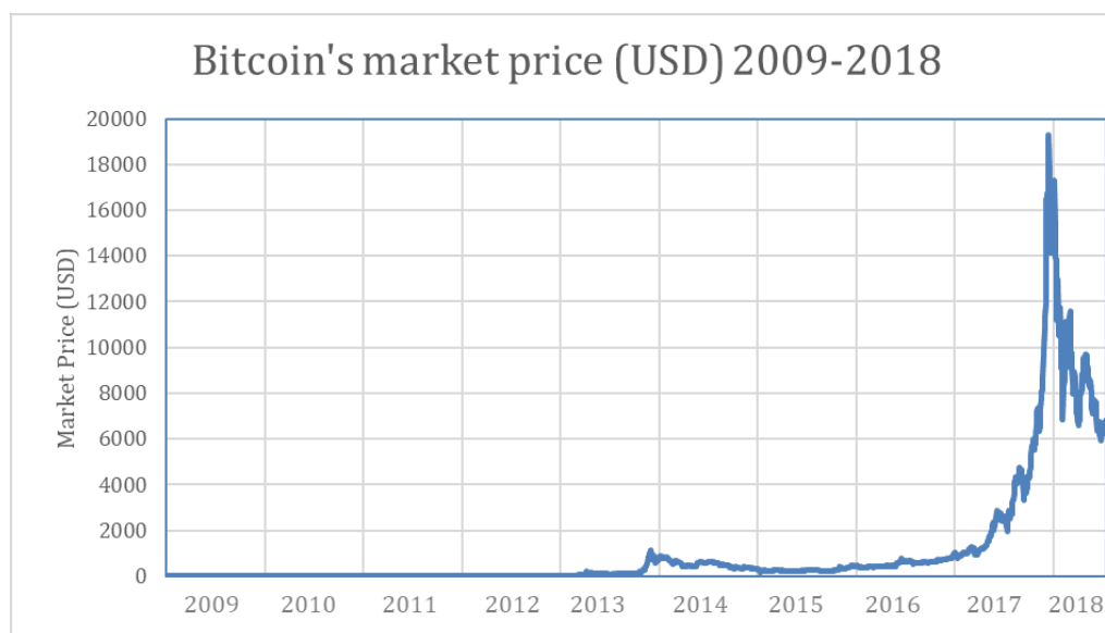
Figure 1: Bitcoin's market price 2009–2018

In sum, the empirical evidence from Bitcoin's financial records appears to contradict the claim that Bitcoin can provide a stable means of payment and store of value, in line with the theoretical prescriptions of Friedman and Hayek.