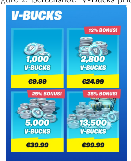
Figure 2: Screenshot: V-Bucks prices