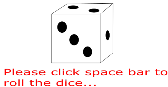
Figure 4: Decision screen in the no time pressure condition