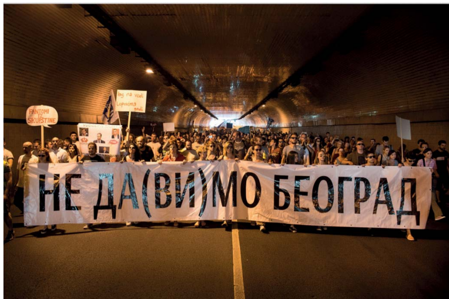
Fig. 3: Public protests against the Belgrade Waterfront project

As the civil sector organizations reacted against the dominant political narrative, and as their voice was more influential than that of the professional community, the next section elucidates the position of the civil sector in Serbian spatial governance.