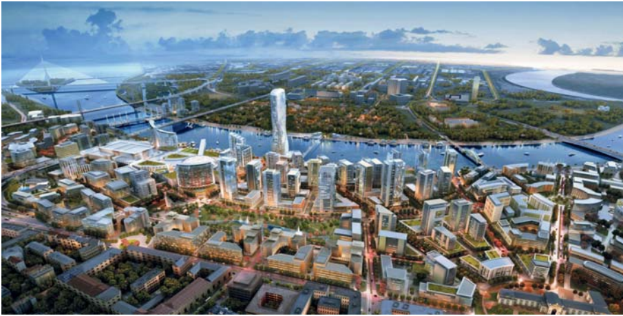
Fig. 2: Belgrade Waterfront project

– with a new shopping mall and a hotel, the future largest and tallest (210m) buildings in the Balkans, respectively, office and commercial spaces, social and cultural spaces, and a large green area. Most of the area will be covered by totally new facilities, while some of the structures of recognized architectural value (e.g. the former main railway station) are to be preserved (Eagle Hills 2015). The project is considered a generator of workplaces, mainly in the construction domain in the first phase, and later by the development of new services. However, a lot of subsidies were provided by the Serbian government to the UAE investor Eagle Hills, i.e. the state is obliged to: clean the riverfront (in terms of environmental clean-up and removal of old buildings and ships), remove the old railway tracks, invest in constructing the new Prokop railway station (outside the BW area), provide all the infrastructural equipment to and on the site, and even lease the land to the UAE investor for 99 years (OG RS 3/2013). 1 The estimated construction costs vary from 3.1 to 8 billion euros, while work on the BW project is scheduled for finalization in 2045, in three phases.