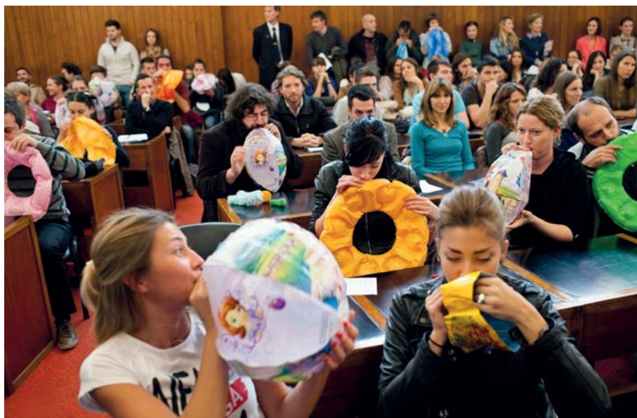
Fig. 4: Public debate in the Belgrade City Hall