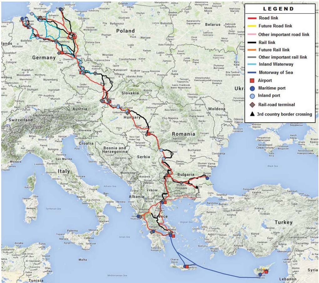
Fig.1: The OEM TEN-T Core Network Corridor, alignment and nodes

original designation as one of the priority projects, and then the modification in 2012 under the name Orient/East-Med (OEM) Corridor (Corridor No. 3 of the nine TEN-T core network corridors).