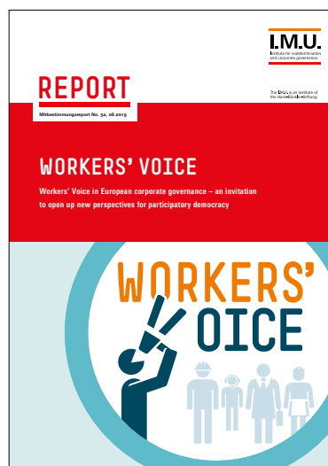
Workers' Voice in European corporate governance – an invitation to open up new perspectives for participatory democracy. Series: Mitbestimmungsreport, Nr. 52e. Düsseldorf: 2019, ISSN: 2364-0413

Interestingly, developments are by no means confined to the European continent. Interest in board level employee representation has emerged, seemingly out of nowhere, even in the United States. For example, for some time now US academics have been collecting information and facts on board level employee