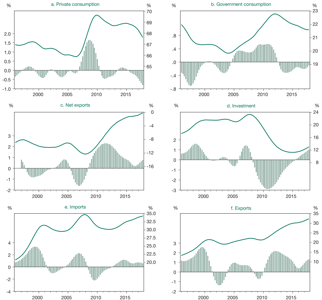
Figure 3 Development of the main components of GDP in percent

Note: Right scale: GDP shares in percent; left scale: quarterly year-to-year changes in percent.