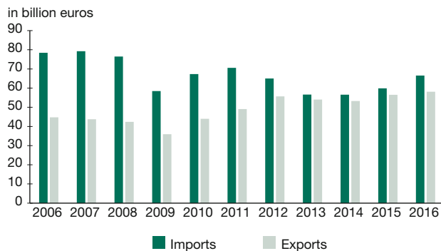
Figure 1 European Union trade with Japan (merchandise goods)