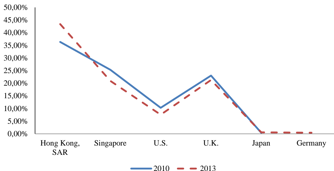
Figure 1 RMB transactions in global major financial centers.

Figure 2 shows the predicted shares of RMB in global foreign exchange market transactions. For simplicity, we only plot transaction shares for RMB in US, UK, Japan, Singapore, Germany and Hong Kong, from 1995 to 2013. The estimates are based on the results of our benchmark specification 20 .