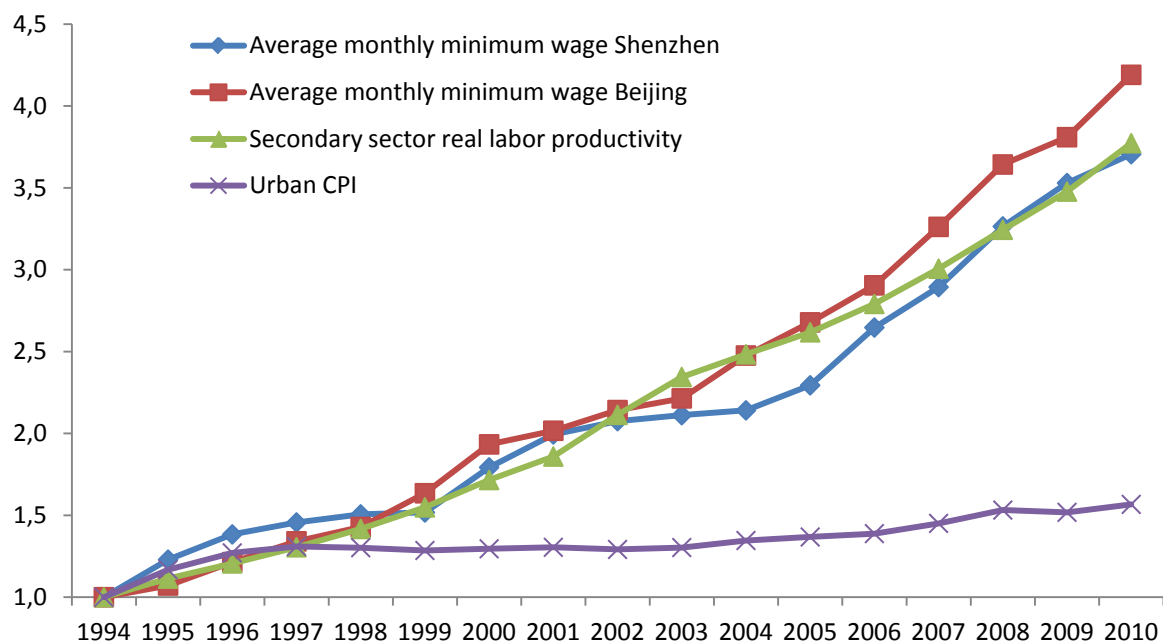
Figure 2 Minimum wage and real labor productivity, 1994=1

The minimum wage data presented here take into consideration increases in the postulated minimum wage during the year; when the data of increase is not known, the most plausible date is assumed.