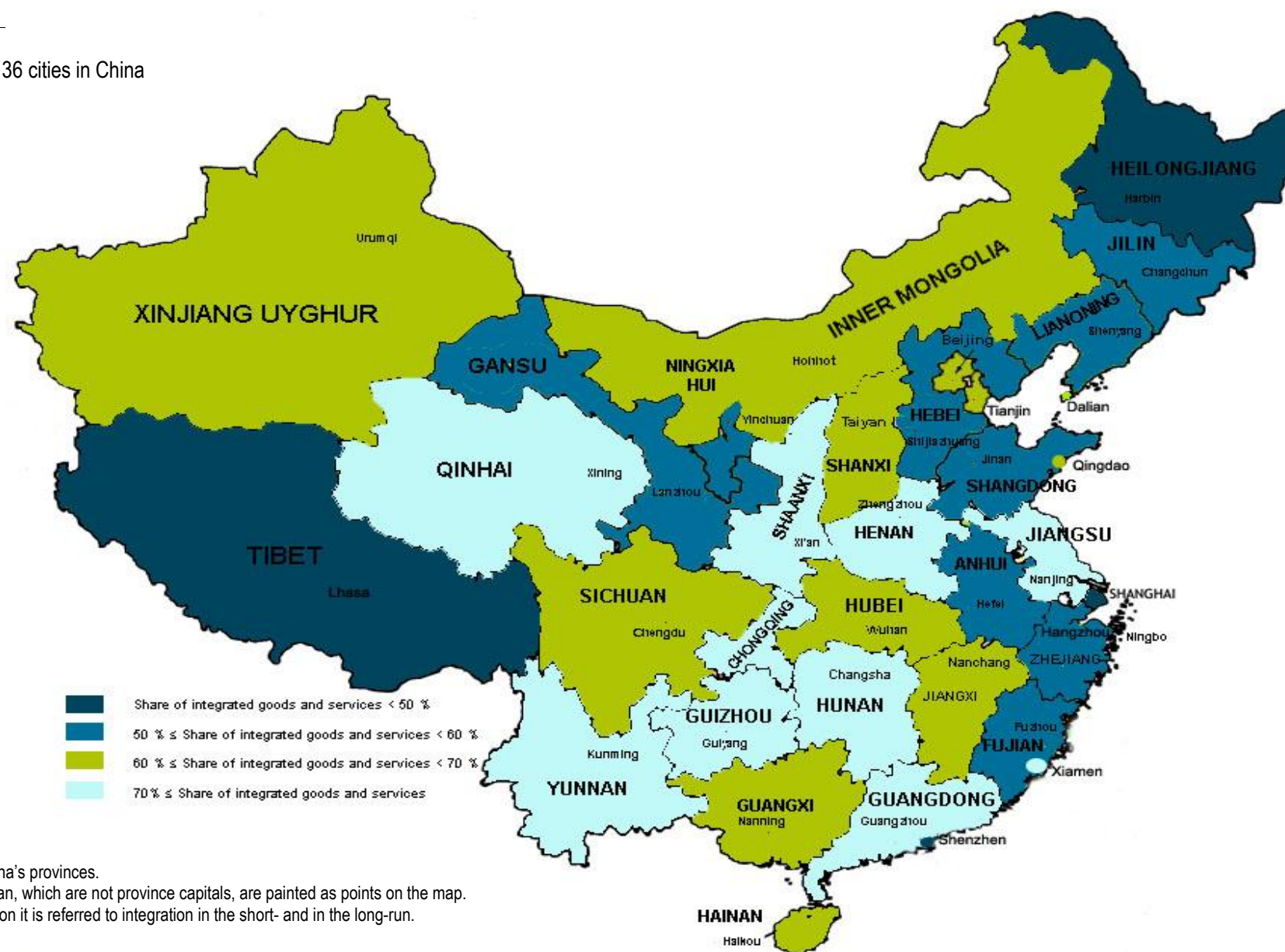
Figure 2. Market integration in 36 cities in China