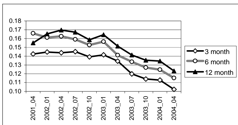
Fig.2 Ruble deposit interest rates evolution, April 2001-April 2004

Weighted average interest rates on ruble deposits were below the inflation rate in 2005. According to the Center for Macroeconomic Research (CMR), the losses of depositors in real terms were 1.6%, 2.7%, 12.6% for dollar, ruble and euro deposits, respectively, during the period January-July 2005.