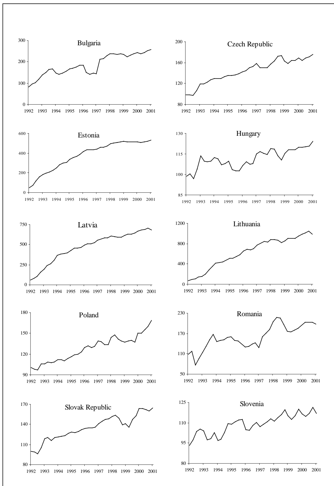
Figure 1. CPI-based real effective exchange rates of central and east European transition countries against a trade-weighted average of 21 (non-transition) OECD countries; quarterly data; 1992:1 to 2001:1; average value for 1992 normalized to 100; source: BIS