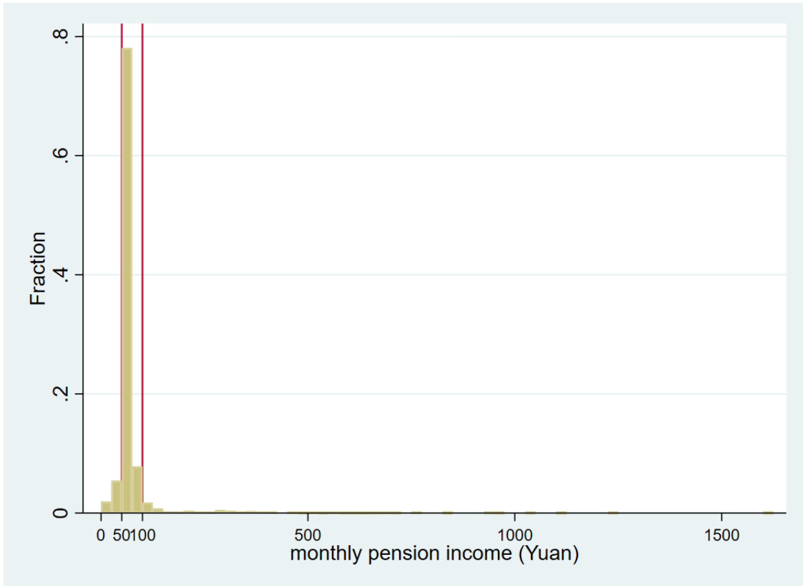
Figure A1: Distribution of monthly pension income (Yuan)