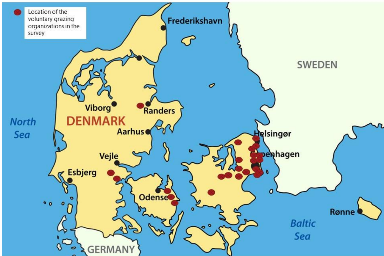
Fig. 1. Location of the voluntary grazing organisations participating in the study.