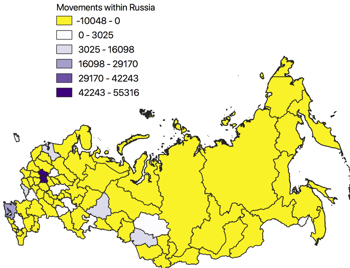
Pic. 1. Internal migration (movements within Russia) in 2008 (Net migration, calculated as a number of people arrived to the region minus number of people departed from the region)