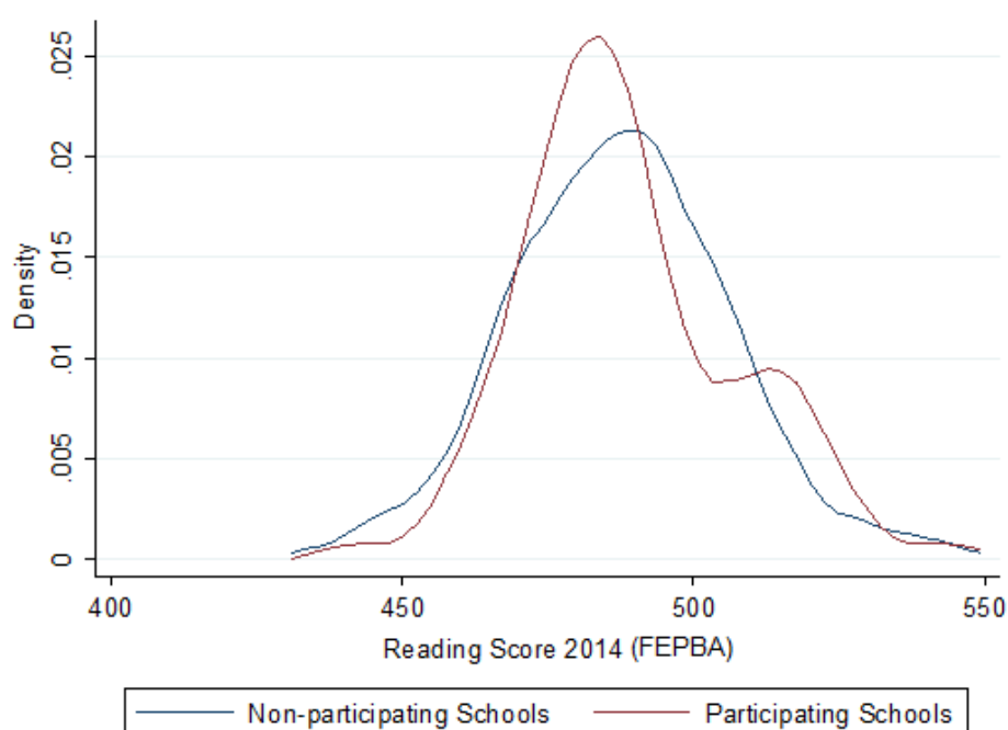
Figure A4.1 Distribution of FEBPA scores

Note: N indicates the number of schools. * indicates that the difference of means test is significant at 10%.