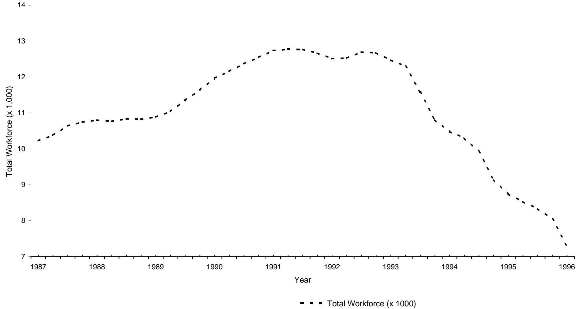
Figure 1: Evolution of a Workforce Fokker Aircraft b.v.