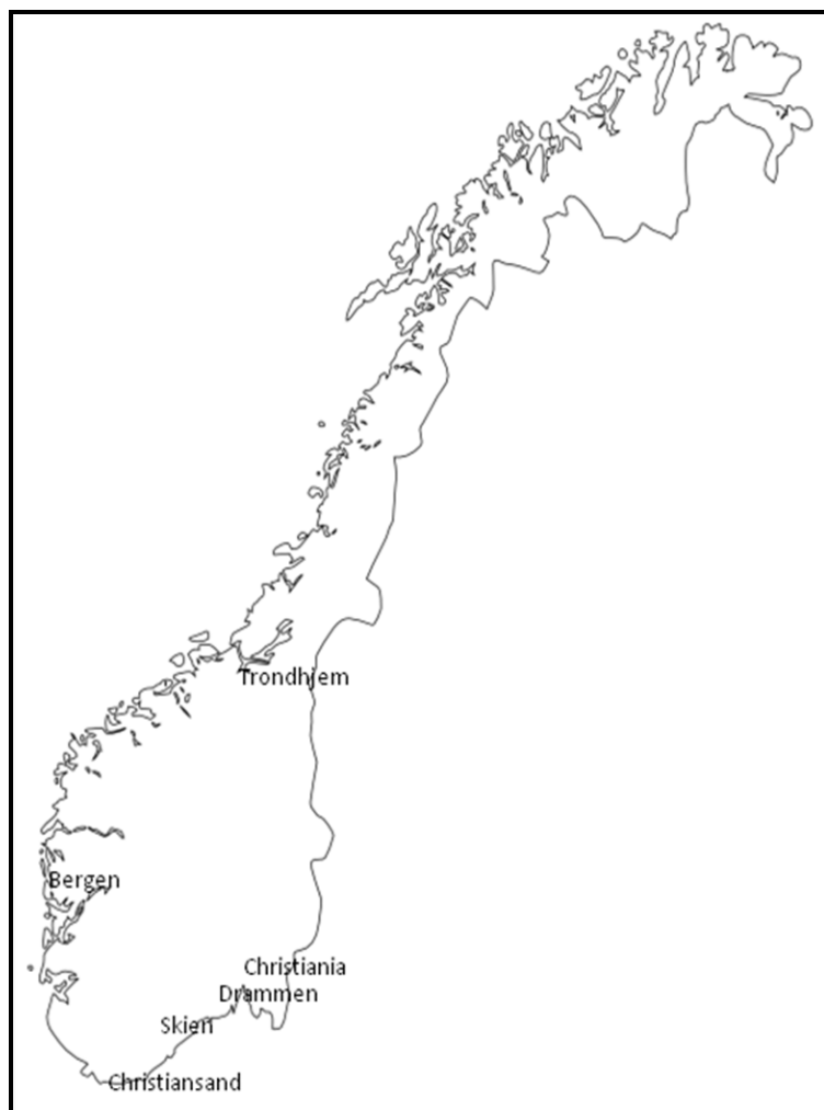
Map 1: The branches of Norges Bank