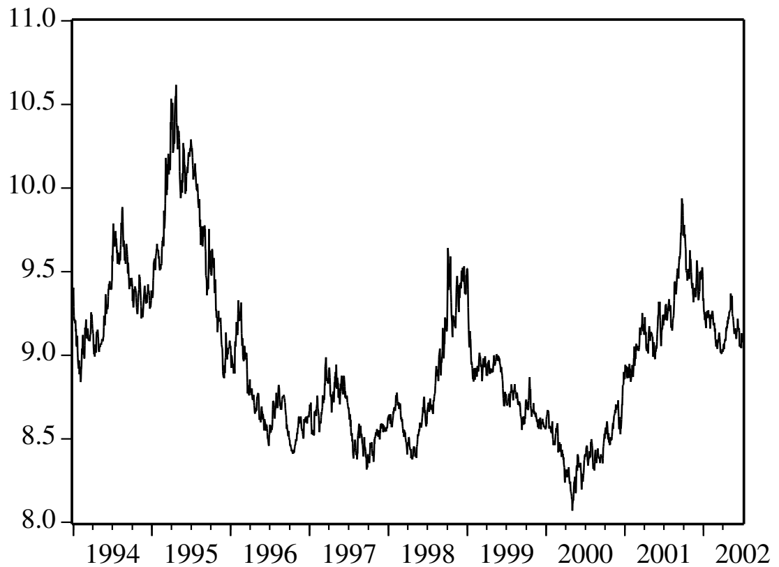
Fig. 1. The SEK/EUR exchange rate

Sample: 1.1994-6.2002. Note that for observations prior to January 1, 1999, we use DEM instead of EUR. Before January 1, 1999 the majority of SEK trading was conducted in DEM as it is currently conducted in EUR.