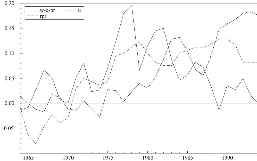
Figure 2: Logs of real unit labour costs, unemployment rate and replacement rate. Scales and means are adjusted.