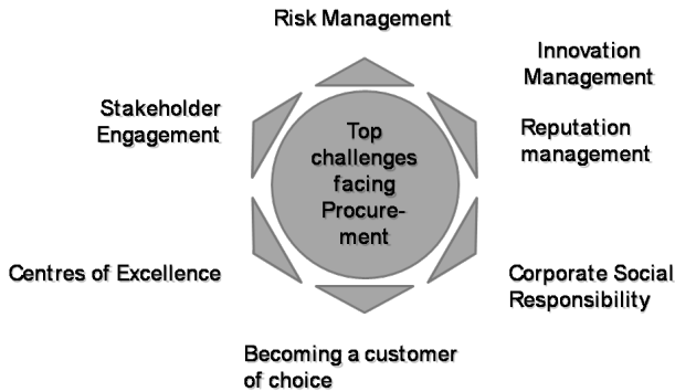
Figure 3: Challenges of procurement (Adapted from: Crawshaw, 2017)

important to demonstrate a partnership approach and develop a close network with the suppliers of new technology and data as well as with external and internal customers. These details are very important to exploit all advantages of additive manufacturing along the supply chain. Mentioned advantages have to be implemented already at the supplier stage to functionally integrate product parts at an early stage, so that the reduction of product complexity and a reduction of temporary storage can be spread as a monetary benefit alongside the complete supply chain. Centers of excellence can help establish the required know-how of new technologies and spread it throughout the organization as a support function. Procurement needs greater connections with stakeholders in the future to stay competitive, which is especially important for additive manufacturing networks.