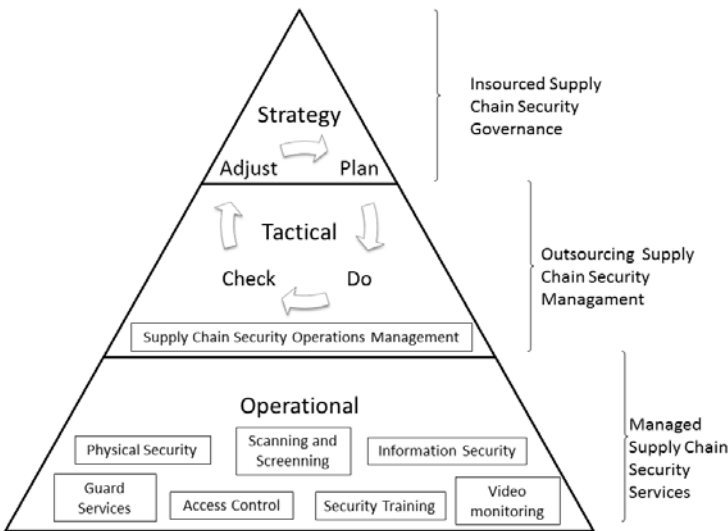
Figure 2 Layers of SCS outsourcing, adapted from Tsiakis and Tsiakis (2013)

operational level are most common for outsourcing. More and more companies are offering also SCS related services at tactical level, i.e. consultancy or developing security plans. The most advanced SCS service providers can also manage all of their customers’ operational, tactical and strategic SCS activities, as the 4PL providers do in the area of supply chain management.