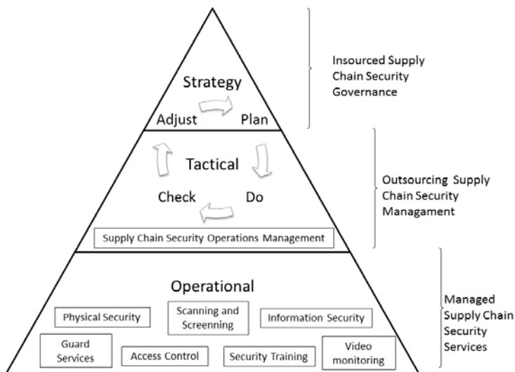
Figure 2 Layers of SCS outsourcing, adapted from Tsiakis and Tsiakis (2013)

operational level are most common for outsourcing. More and more companies are offering also SCS related services at tactical level, i.e. consultancy or developing security plans. The most advanced SCS service providers can also manage all of their customers' operational, tactical and strategic SCS activities, as the 4PL providers do in the area of supply chain management.