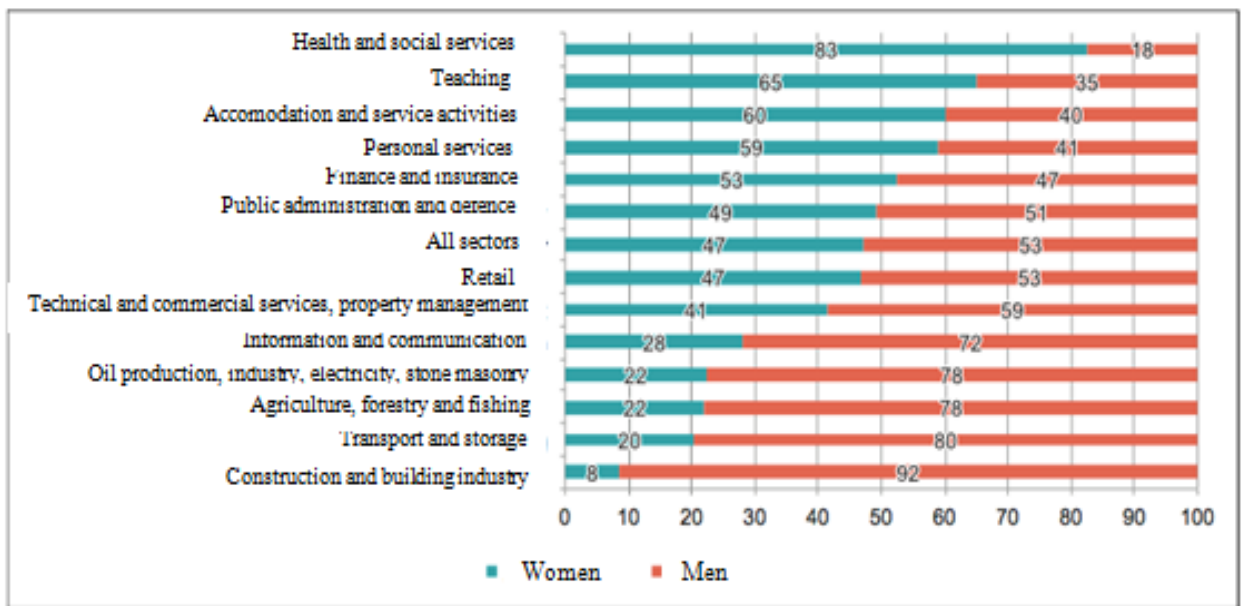
Table 1. Percentage of employed women and men in different labour markets in Norway. (Statistics Norway 2015)

Despite Norway being a gender-equal welfare state, gender equality is not reflected in the Norwegian labour market – a paradox which has long been referred to as the Norwegian gender equality paradox (Reisel & Teigen 2014: 11). That certain occupations are associated with a particular gender applies to all occupations in this study, which consist of construction, industrial production, skilled manual work, oil and gas production, industrial fishing and the Navy 2 .