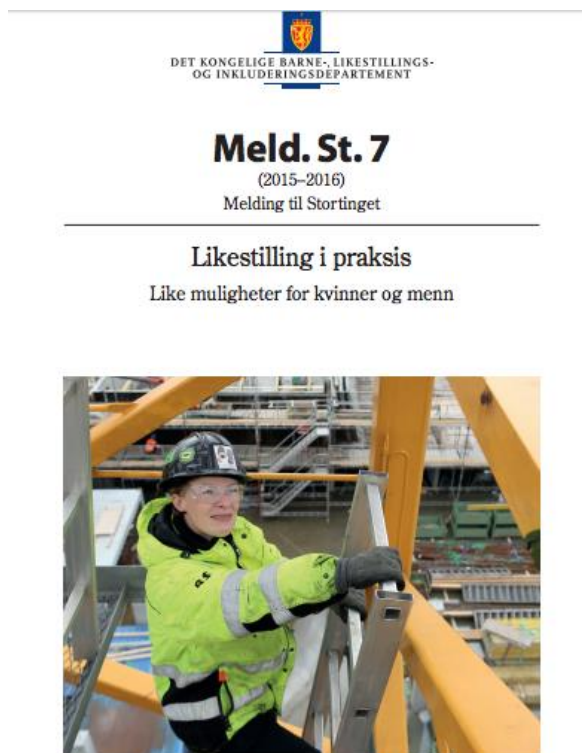
Picture 1. Cover page of the newest Message to Parliament on gender equality (Meld. St. 7 (2015-2016))