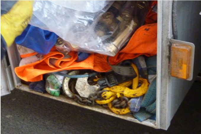
Picture 6. Raingear placed in a hatch of a truck.

is suitable to generate knowledge about how clothes are acquired, maintained, stored and disposed of. This method also helped gather information about the choices being taken in relation to clothing and helped explain these practices.