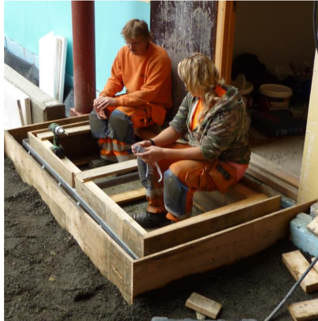
Picture 2: Two construction workers taking a break from their manual work tasks.

The Picture 2 above show a woman and a man dressed in the typical work uniform that is treated in this dissertation. Here you can see the garments in high visibility colours, the pants with pockets and loops to accommodate small tools and the protective boots protecting the worker's feet. These elements points towards its uniformed nature as a way of identifying the workers belonging to a specific manual occupational group. If you look closer, the picture also reveals how ill-fitting the work uniform is on a women's body – the kneepads falling below her knees and the short length of the uniform in the waist where a t-shirt must cover it. This picture show how private garments is combined with obligatory garments – a camouflage hoodie combined with high visibility garments. It also reveals the long hair that perhaps specifically tells us that one of the persons sitting there are a woman.