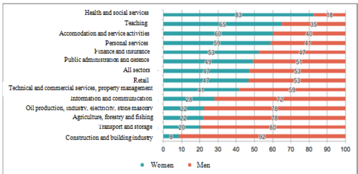
Table 1. Percentage of employed women and men in different labour markets in Norway. (Statistics Norway 2015)

Despite Norway being a gender-equal welfare state, gender equality is not reflected in the Norwegian labour market – a paradox which has long been referred to as the Norwegian gender equality paradox (Reisel & Teigen 2014: 11). That certain occupations are associated with a particular gender applies to all occupations in this study, which consist of construction, industrial production, skilled manual work, oil and gas production, industrial fishing and the Navy 2 .