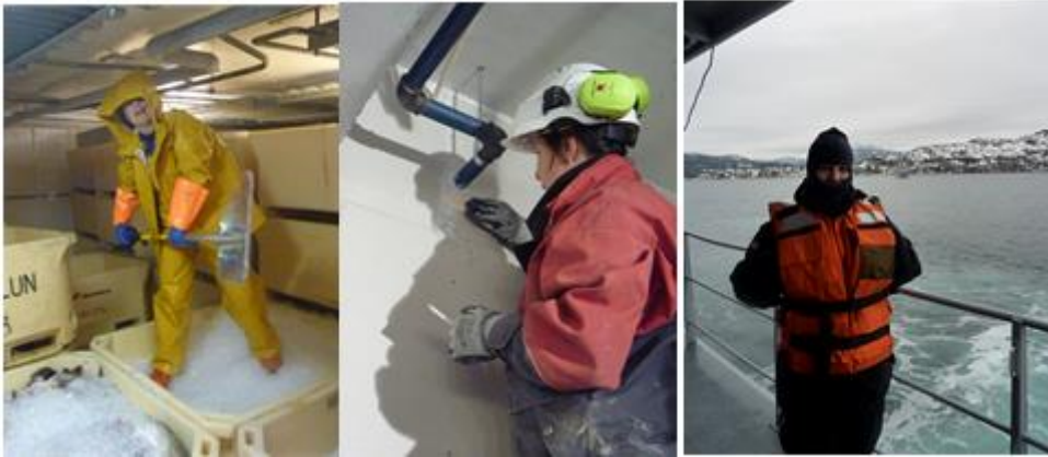
Pictures 3, 4, 5. Participant fieldwork in three occupations: industrial fishing, construction and the Navy.

I wanted to find out how both uniforms and other items were used and how gender was communicated, or under-communicated at work, for example through accessories, style changes, makeup, jewellery etc. By wearing the clothes myself, where possible, I also gained access to the embodied experiences with these clothes and how these experiences are integrated into the work and into social interactions. This is illustrated in the Pictures 3, 4 and 5 presented above, which show me involved in participant research in three of the field sites: fishing, construction and in a Navy vessel. In the pictures, the fit of the clothes are visible; the clothes are too big and too narrow in all the wrong places. This restricts the movements and hinders much of the work tasks. By wearing the same clothes as the workers I also wanted to find out how the clothes these female and male workers use could contribute to inclusion and exclusion, and how the apparel functioned as reproducing or challenging everyday practices related to clothing and gender.