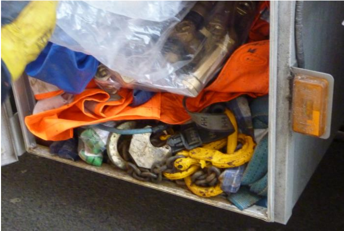
Picture 6. Raingear placed in a hatch of a truck.

is suitable to generate knowledge about how clothes are acquired, maintained, stored and disposed of. This method also helped gather information about the choices being taken in relation to clothing and helped explain these practices.