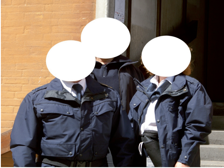
Picture 2 Uniformed Parking attendants, 2004