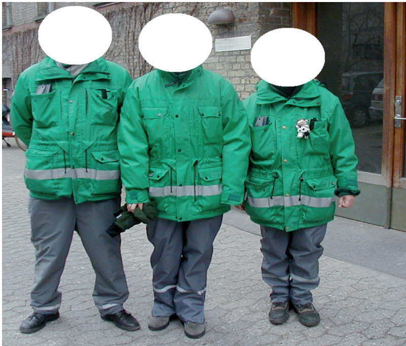
Picture 1 Uniformed parking service assistants in 1998

environmental friendliness. The formal name of the parking attendants was “parking service assistants”, and on a label on their uniforms, which is not visible in the picture, was written “parkingservice”.