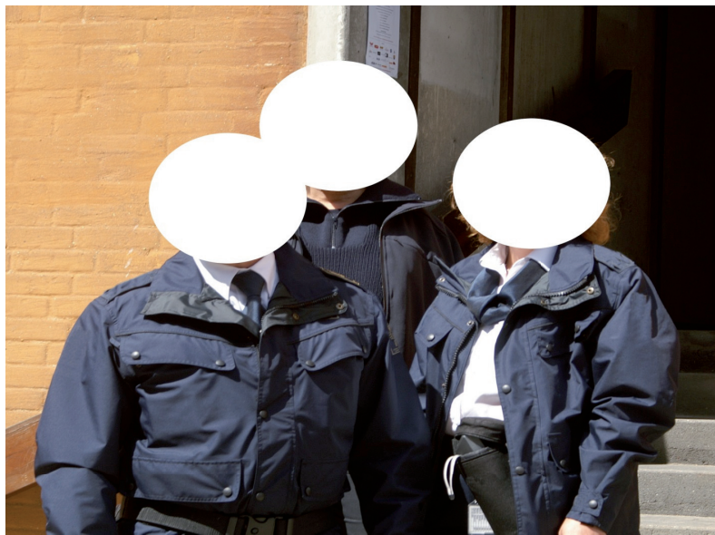
Picture 2 Uniformed Parking attendants, 2004