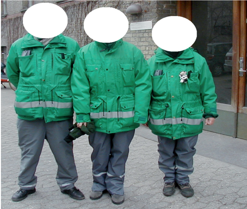
Picture 1 Uniformed parking service assistants in 1998

environmental friendliness. The formal name of the parking attendants was “parking service assistants”, and on a label on their uniforms, which is not visible in the picture, was written “parkingservice”.