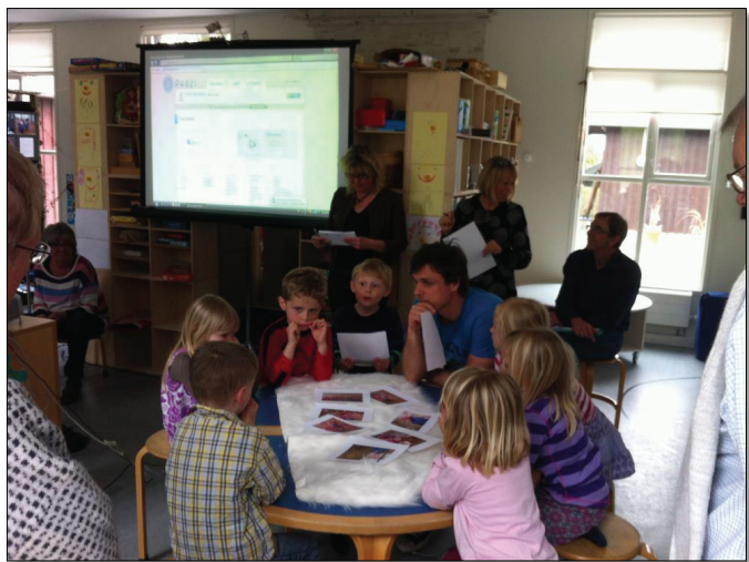
Figure 1: A governance lab at a daycare