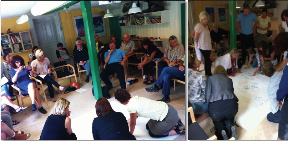
Figure 2: Photographs of ‘organizational mapping’.