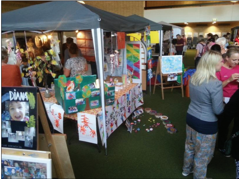
Figure 3: Daycare marketplace