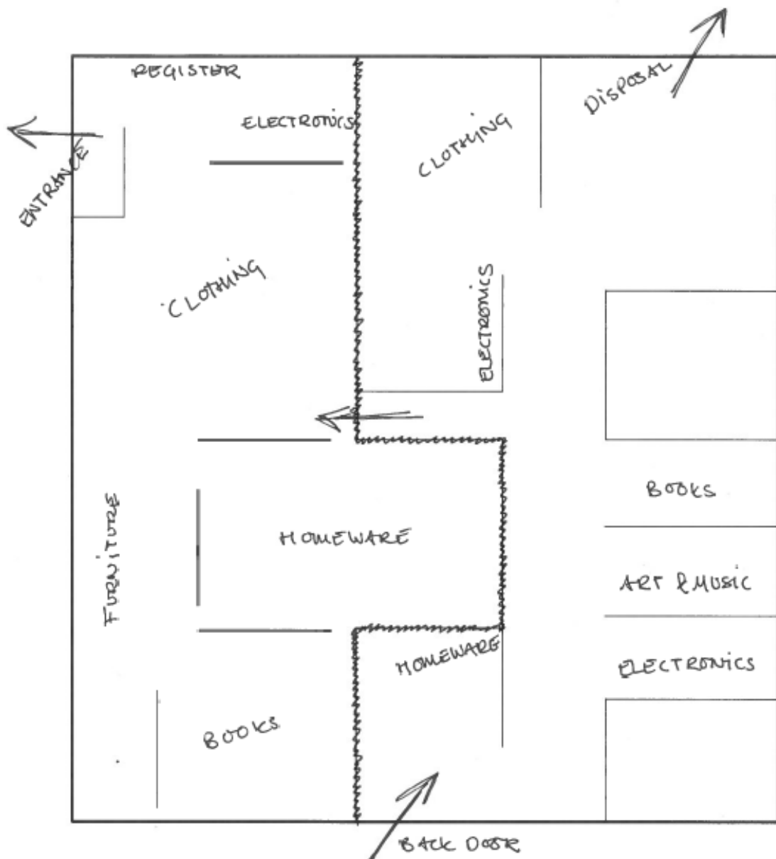
Figure 1: Floorplan of the Tavern Guild Community Thrift store

In every department, shelves and racks are positioned close together and packed with stuff, and the store easily holds thousands of items at any given time. To help clear out the stuff that does not sell within a short time, several sales are offered in the course of each month, the biggest one being held on the first Monday of the week, when everything in the store is sold at a 50% discount.