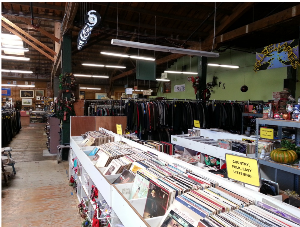
Interior view of the store

The retail area covers approximately two-thirds of the warehouse; the rest is the back area where only employees and volunteers have access. The store has two entrances, and two further doors are located on each side of the building facing the two alleys on either side. One of these is used primarily for access for employees and for loading stuff for recycling into vans; the other door is the ‘heart’ of the facility, as this is where people drop off donations and where objects are received, sorted and priced.