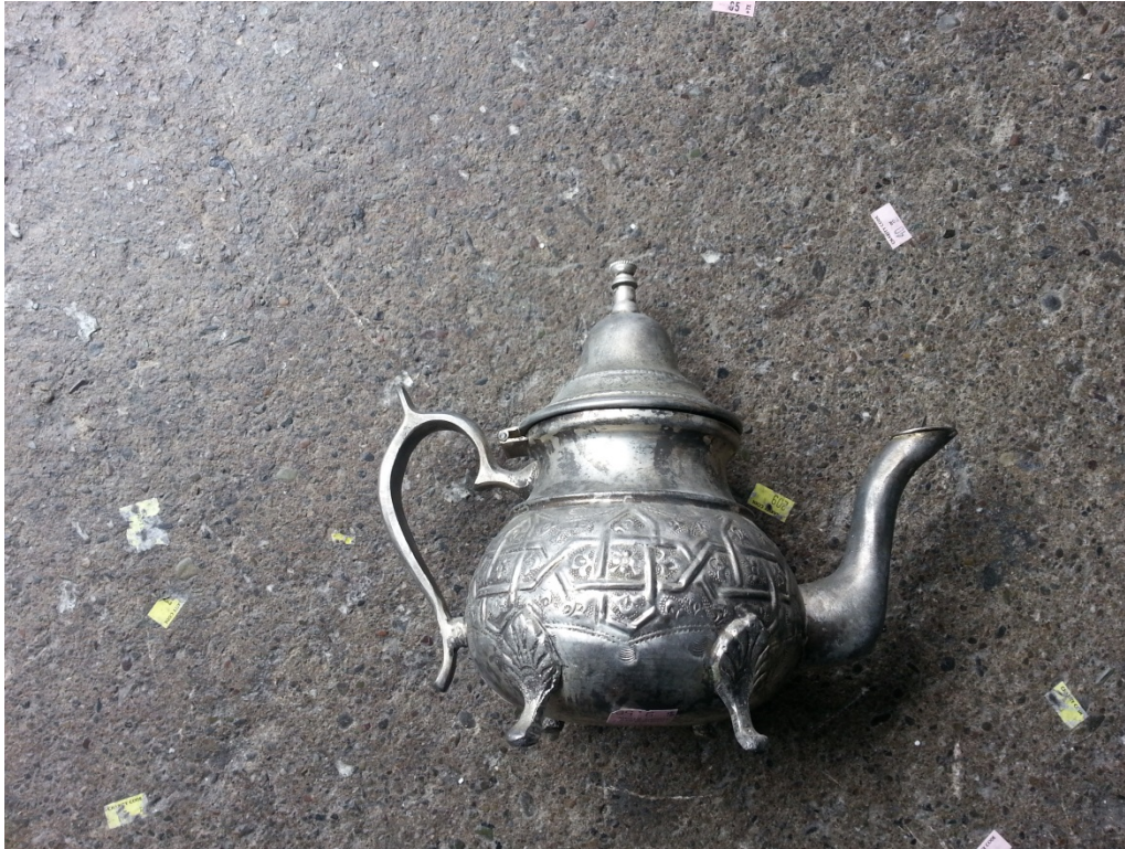
One of the objects: metal teapot