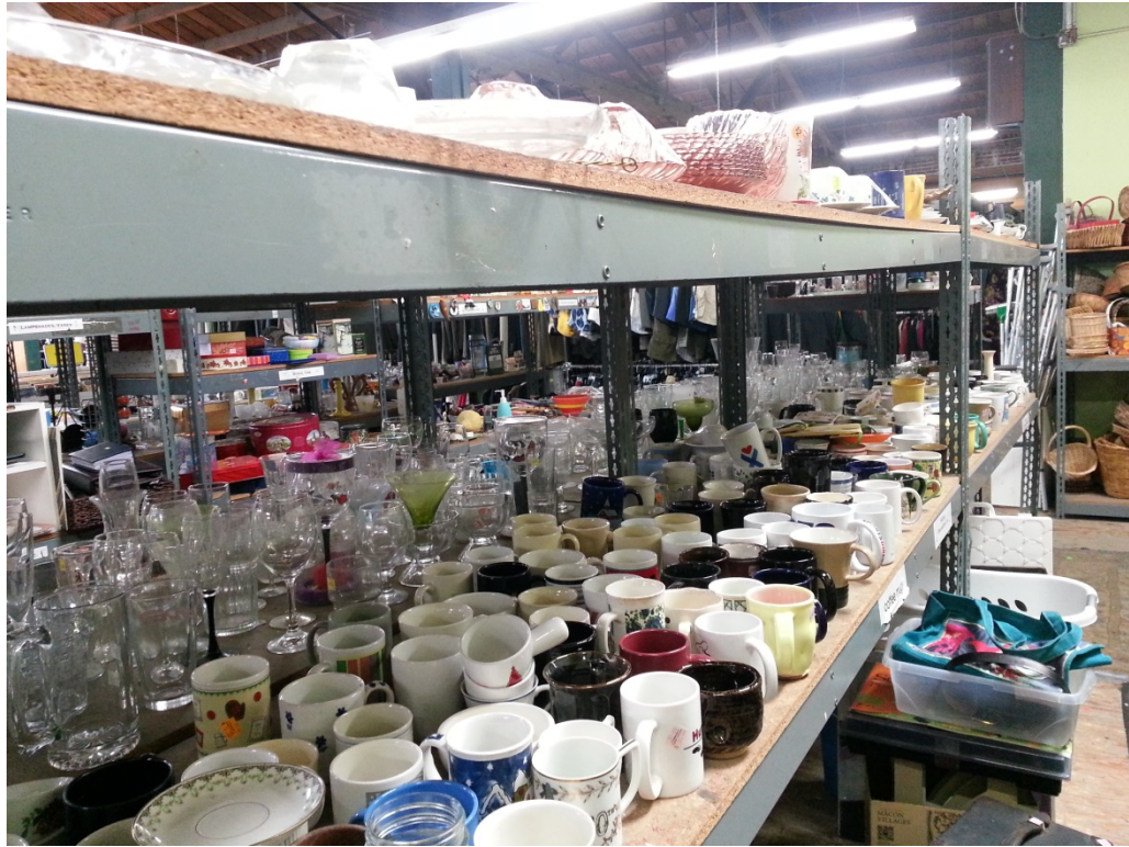
The homeware department

with the price, department, and charity code. Most of the items I called during my time at CTS were reduced in price by between 50 c and 2 $.