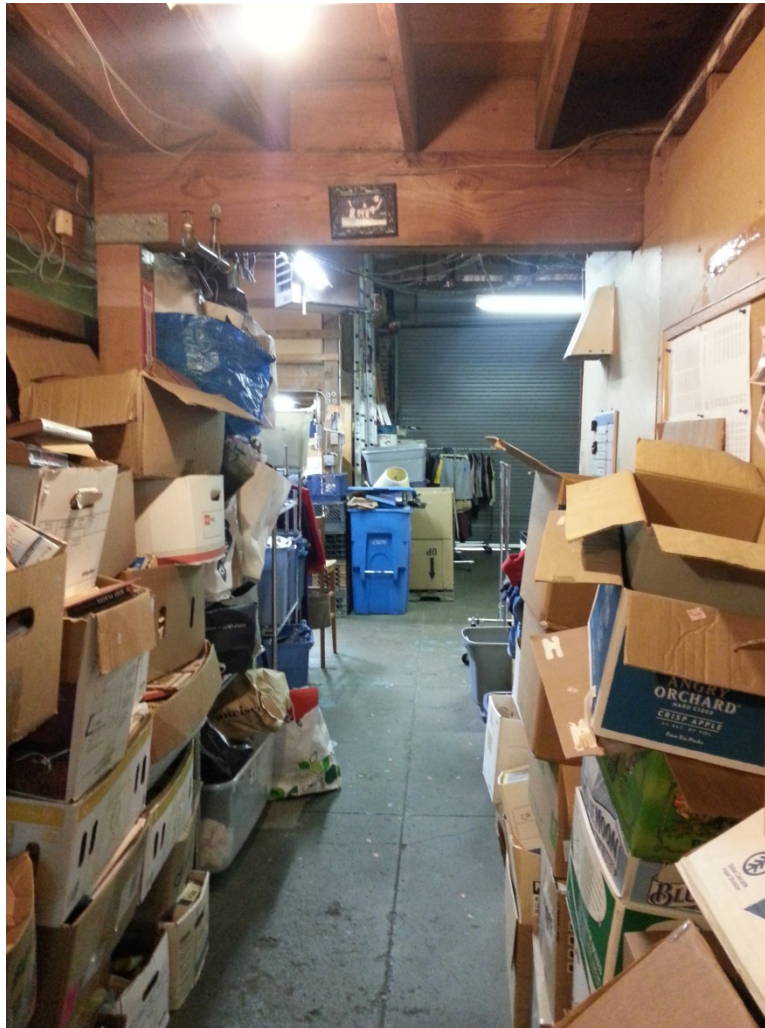
Boxes of books waiting to be picked up