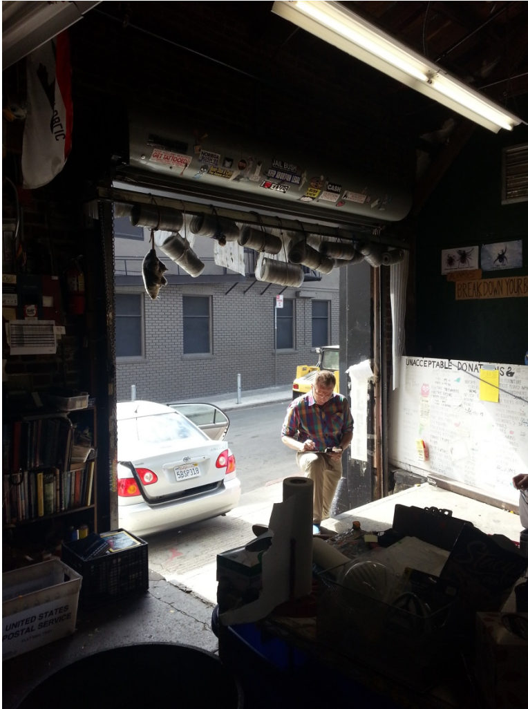
Donor dropping of donations at the back door

The first station in the trajectory from donation to resale is ‘the back door’. The back door is located on the right side of the building opening onto a small street where vehicles can pull up and people can unload donations directly onto the dock. Inside the door, which is more like a gate, the donations go through the primary stage of rough sorting. Next to the gate there is a sign informing donors of which items the organization accepts and what it does not accept. Most of the time, two employees are stationed here to assist donors and perform the initial sorting. The donors are relatively involved in this process, since they hand over the donations directly to the employees. Most of the time this meeting is quite