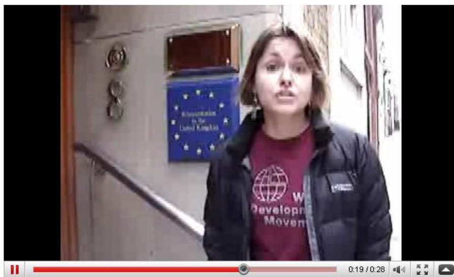
Figure 11: Stills from WDM's WSF Day of Action video in YouTube

The video from the WSF Day of Action shows an unedited shot from the offline event outside the European Commission's offices in London. In the clip a WDM member wearing a WDM t-shirt talks to the camera, explaining that they are there "to protest against the unfair trade deals that Europe are pushing across the developing world". 31 Although the SMOs Friends of the Earth and War on Want are not visible in the shot, the WDM member tells the camera that they are part of the event. The combination of the visual representation of WDM and the verbal reference to the two SMOs yet again demonstrates the contradictory relationship between promoting WDM and