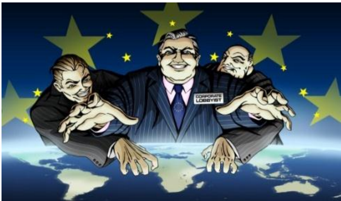
Figure 12: Photo from War on Want's Get your new MEPs to fight for trade justice petition

The technologisation of action that the email petitions in War on Want's website represent does not explicitly invite involvement beyond the petition. Linguistically it tries to incite a sense of agency by mentioning that "Resistance to this exploitation [from European companies] continues to grow ... partly due to mass protests by ordinary people". Telling us that the efforts of 'ordinary people' can make a difference works to show us that our participation matters. Yet this is followed by 'ACT NOW: choose your region from the box above' in bold types. 'The region above' links to a pre-drafted email petition to the selected MEP. Connecting 'protests by ordinary people' to the email petition reduces possibilities for action to this brief mode of engagement. Cases of resistance in Peru, India, South America and parts of Africa also work to reiterate War on Want's interregional orientation and solidarity with social movements across the globe. This construction of equivalences is further highlighted by War on Want's pledge to "continue to stand in solidarity with those whose lives and hopes are blighted by free trade".