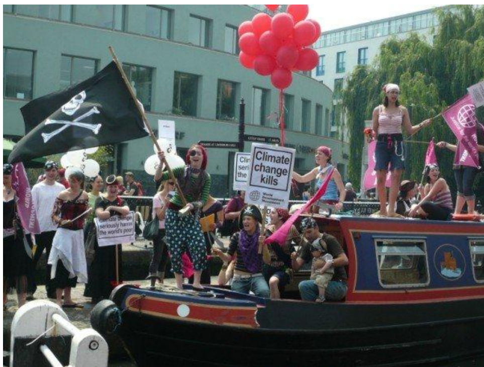
WDM campaigners against climate change.