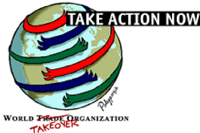
Figure 4: Campaign photo in WDM's trade campaign website www.wdm.org.uk/trade-campaign , WDM, 2009

notions of dissent and can be seen as an attempt at placing WDM at the radical end of a GJM spectrum in the UK. Further, this serves to destabilise free trade as a way to facilitate growth and prosperity that the hegemony of neo-liberalism constructs as taken for granted.