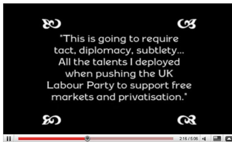
Figure 9: Stills from WDM’S The Trade Dictator video

While ‘The Trade Dictator’ video addresses an issue that is pertinent at the EU level, the focus on Mandelson – a central figure in UK politics – repositions the issue of EU