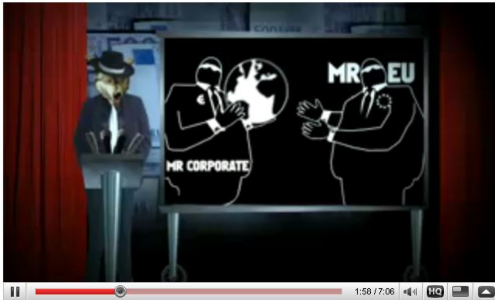
Figure 10: Stills from WDM's The Great Trade Robbery video

In addition to length, the video shares a number of common traits with The Trade Dictator . First, the video addresses the issue of EU trade deals from the perspective of an imaginary EU policy maker, represented as a wolf. The wolf addresses an assembly mainly consisting of sheep representing “the major players in international business”, but also including suit-clad, animation versions of political despots ranging from Lenin and Hitler to Mao. As in The Great Trade Dictator , portraying these characters together serves to suggest that international businesses operate in a dictatorial, undemocratic manner. The main story relayed by the wolf represents the US, EU and Japan as sharks hunting for “fresh markets, after all this is the era of globalisation”. Representing the trading powers as sharks serves to construct them as predators. This construction of the US, EU and Japan as predators and three of the major trading powers identifies the US, EU and Japan as enemies. The title of the clip is an allusion to the 1963 train robbery on the Glasgow/London connection that became known as The Great Train Robbery 30 . This constructs the EU as robbers, emphasising their role as the villain. The comparison to robbers portrays the US, EU and Japan as unfair players, gesturing towards a role as enemies rather than adversaries. Yet, as the aesthetics of the silent