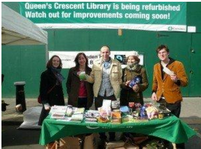
WDM North London and Friends of the Earth for fair-trade Fortnight in Kentish Town, London 2007.

Most of the photos include WDM banners, showing WDM as a central actor in different modes of protest against neo-liberal globalisation issues. However, several photos from coalition-based events do not represent WDM banners. Five of the photos