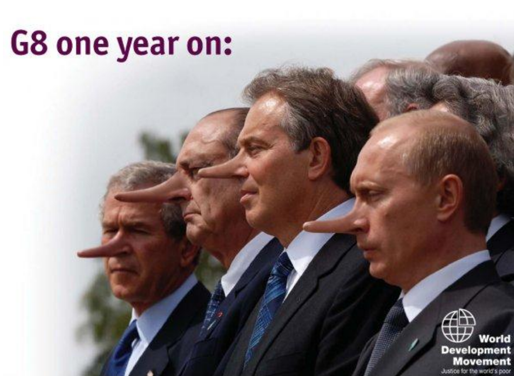
Figure 5: WDM campaign image featured in WDM's group profile

( www.facebook.com/group.php?gid=2318628421&ref=ts#!/group.php?gid=2318628421 )