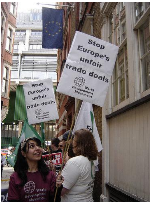
Figure 6: WDM trade campaign protest featured in WDM's Facebook Group profile

The other three photos in WDM's main Group are all from an offline event, related to the World Social Forum day of action, to protest against the EU's trade deals with developing countries. The event took place outside the EU's representation in London. The promotion of offline events in the Group and the photos both testify to an understanding of offline action events as central to WDM's contestatory practices and