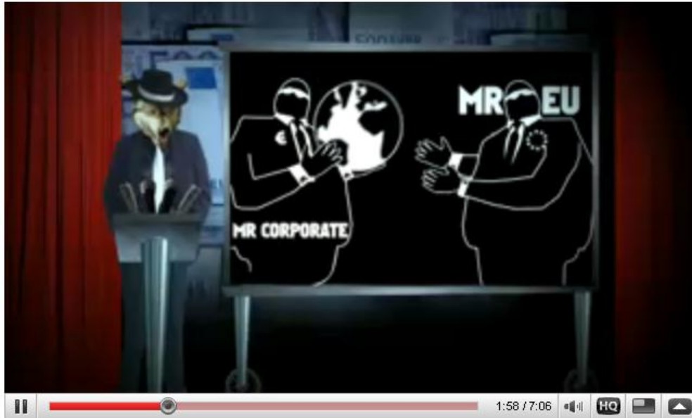
Figure 10: Stills from WDM's The Great Trade Robbery video

In addition to length, the video shares a number of common traits with The Trade Dictator . First, the video addresses the issue of EU trade deals from the perspective of an imaginary EU policy maker, represented as a wolf. The wolf addresses an assembly mainly consisting of sheep representing “the major players in international business”, but also including suit-clad, animation versions of political despots ranging from Lenin and Hitler to Mao. As in The Great Trade Dictator , portraying these characters together serves to suggest that international businesses operate in a dictatorial, undemocratic manner. The main story relayed by the wolf represents the US, EU and Japan as sharks hunting for “fresh markets, after all this is the era of globalisation”. Representing the trading powers as sharks serves to construct them as predators. This construction of the US, EU and Japan as predators and three of the major trading powers identifies the US, EU and Japan as enemies. The title of the clip is an allusion to the 1963 train robbery on the Glasgow/London connection that became known as The Great Train Robbery 30 . This constructs the EU as robbers, emphasising their role as the villain. The comparison to robbers portrays the US, EU and Japan as unfair players, gesturing towards a role as enemies rather than adversaries. Yet, as the aesthetics of the silent