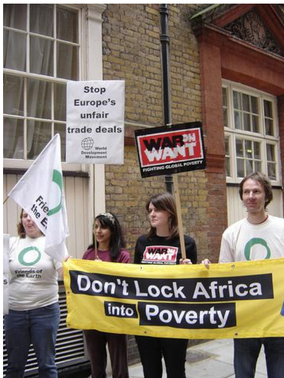
Figure 7 WDM, War on Want and FoE outside the London EU office

This works to contextualise the demonstration and points to the WTO as well as specific multinational businesses as adversaries and ‘the poor’ as part of the WDM ingroup. It does so by articulating agribusiness companies Bunge, Cargill and Migros as “venues of agricultural crime”. The use of the signifier ‘crime’ extends the intertextual link between ‘cooked up’ (the WDM website), ‘justice’ (WDM’s website, Facebook) and the growing Pinocchio noses of the 2004 G8 leaders (WDM’s group profile, Facebook), inscribing the identification of adversaries into a discourse of justice.