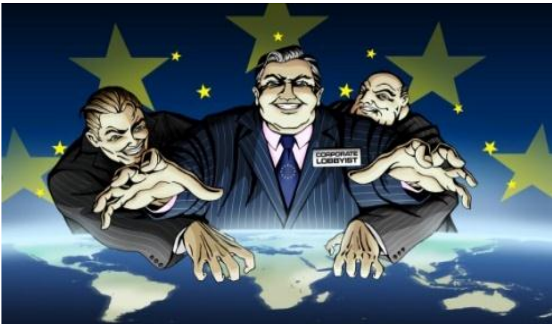
Figure 12: Photo from War on Want's Get your new MEPs to fight for trade justice petition

The technologisation of action that the email petitions in War on Want's website represent does not explicitly invite involvement beyond the petition. Linguistically it tries to incite a sense of agency by mentioning that "Resistance to this exploitation [from European companies] continues to grow ... partly due to mass protests by ordinary people". Telling us that the efforts of 'ordinary people' can make a difference works to show us that our participation matters. Yet this is followed by 'ACT NOW: choose your region from the box above' in bold types. 'The region above' links to a pre-drafted email petition to the selected MEP. Connecting 'protests by ordinary people' to the email petition reduces possibilities for action to this brief mode of engagement. Cases of resistance in Peru, India, South America and parts of Africa also work to reiterate War on Want's interregional orientation and solidarity with social movements across the globe. This construction of equivalences is further highlighted by War on Want's pledge to "continue to stand in solidarity with those whose lives and hopes are blighted by free trade".