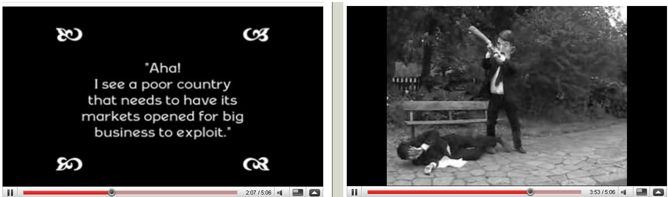
Figure 8: Stills from WDM's The Trade Dictator video

'The Trade Dictator' is a five minute black and white silent movie that shows a caricatured then European Trade Commissioner Peter Mandelson conjuring up strategies for "...get[ting] what we want from poor countries in the global trade talks...". The title is an intertextual reference to Chaplin's film 'The Great Dictator' about Hitler. The Mandelson character then executes these strategies by "bullying poor countries" into having their "markets opened for big business to exploit". The "poor countries" are represented by a man reading a newspaper in a park. Mandelson's "bullying" is aesthetically represented as the caricature character beats the man with a club until he surrenders.