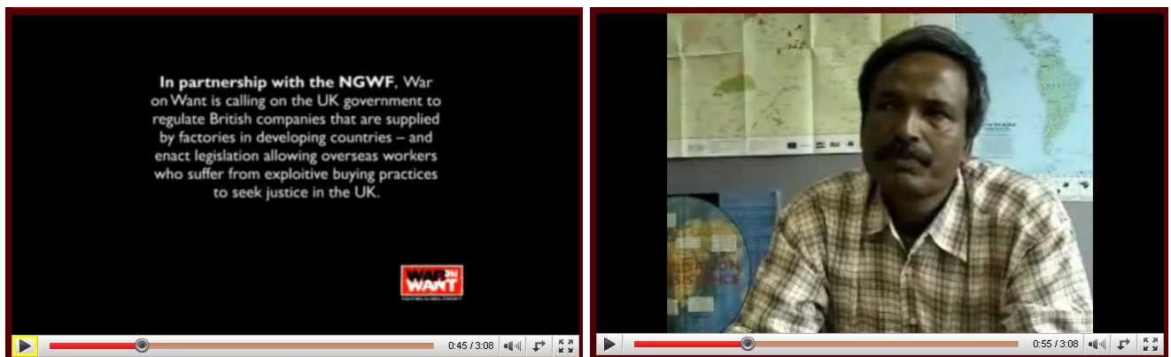
Figure 13: Stills from Bangladesh trade union leader on sweatshops video

War on Want’s YouTube channel includes a total of 45 videos. Three of these are directly related to the trade justice campaign: “Bangladesh trade union leader on sweatshops”, “Why it is so important to lobby your MEP”, “World Social Forum day of action”, and “Down Down WTO”. The 2009 “Bangladesh trade union leader on sweatshops” features an interview with a Bangladesh trade union leader. 40 Here, he talks to an off-camera interviewer about sweatshops. This creates an equivalential chain between War on Want’s causes and the demands and interests of NGWF and other local trade unions across regions and in developing countries. The text edited into the video saying that “War on Want is calling on the UK government to regulate British companies that are supplied by factories in developing countries – and enact legislation allowing overseas workers who suffer from exploitive buying practices to seek justice in the UK.” takes a local UK focus. Further, it calls for legislative changes rather than voluntary CSR initiatives or pressure on companies through political consumerism.