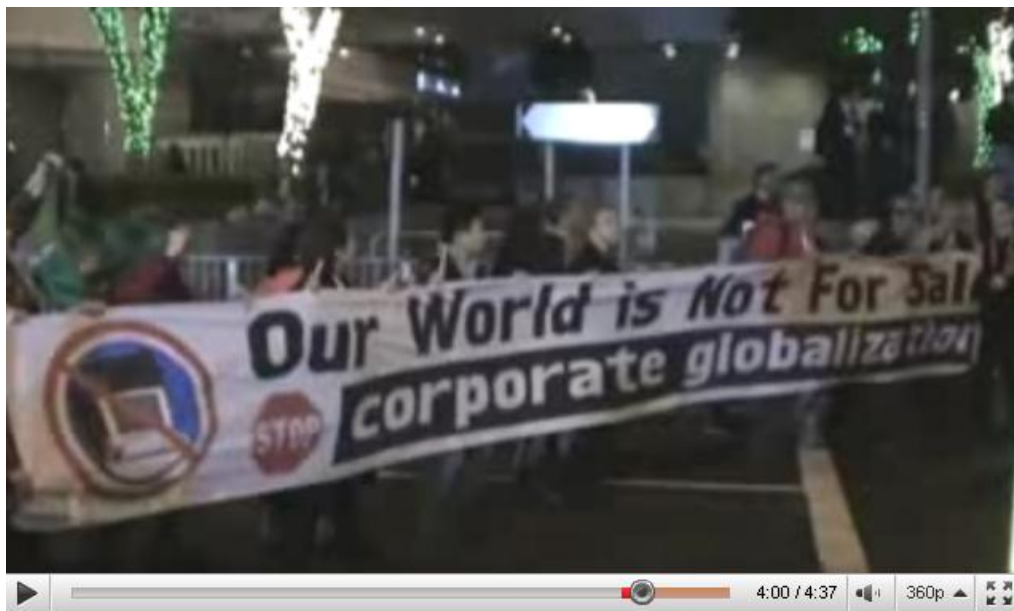
Figure 16: Down Down WTO video featured in War on Want's YouTube channel

The aesthetic properties of the “Down Down WTO” video contrast images of farming communities in developing countries with images of trade talks in privileged locations, secluded and patrolled by police, far from many of the people they affect. This serves to show WTO negotiations as detached from the people whose lives are affected by them. This construal of detachment is further extended to an argument of the undemocratic structure that underpins the WTO. To this end, the voice-over explains that “...the WTO has never held a vote. Instead, it allows the world’s most powerful trading blocks...to bully poor countries into submission behind closed doors” and asks “Whose interests does the WTO really serve?...it acts primarily in the interest of big business”. In this way, the WTO as well as corporations are identified as enemies. The antagonistic ambience of the title and the discourse of urgency in the video suggest that this villainous role is not one that is readily turned into a role of adversaries.