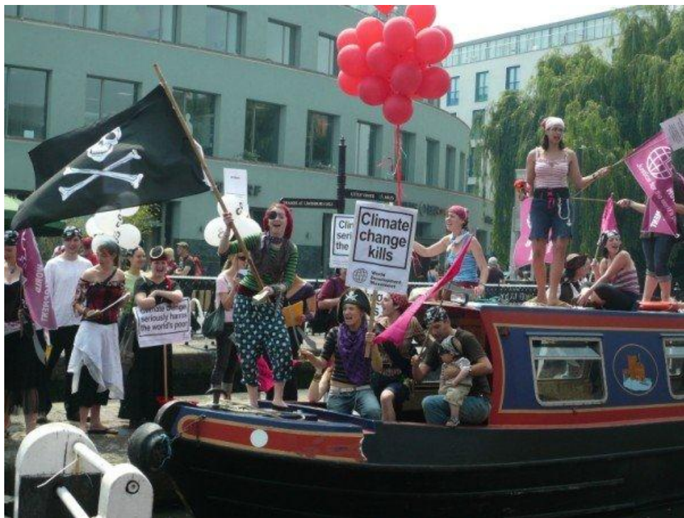
WDM campaigners against climate change.