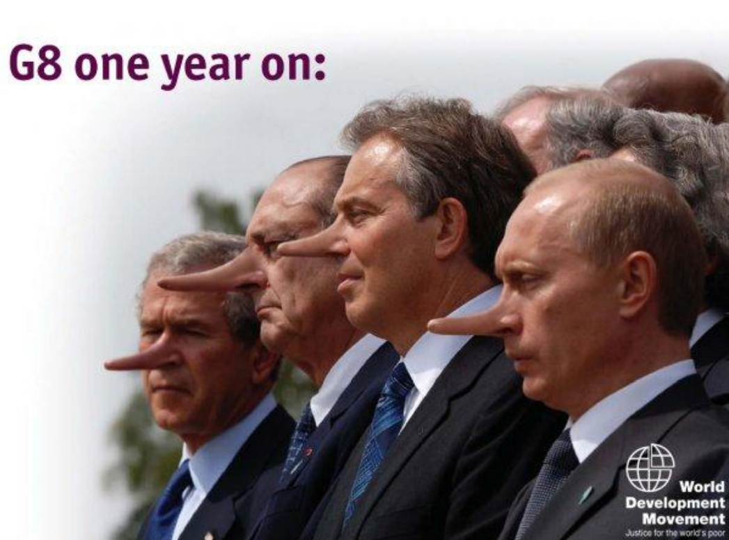
Figure 5: WDM campaign image featured in WDM’s group profile

The five photos in WDM’s Group profile have been added by the WDM web officer, and two of them are graphically modified campaign photos, including the one featured in the SMO website. The other modified campaign photo shows four of the G8 leaders who were present at the summit in 2004. Bush, Chirac, Blair and Putin are represented with digitally enhanced noses so as to resemble the lying Pinocchio.