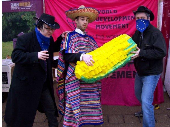
WDM North London and Southwest London campaigners.

staged in relation to the European trade hustings events and The Great Trade Robbery video promoted in WDM's YouTube channel. The photos represent South West as well as North London group members, foregrounding a WDM London alliance rather than inter-group distinctions. Drawing on the rhetorical strategies in The Great Trade Robbery video, the event portrayed in the photos uses humour and irony to draw attention to the problem it identifies.