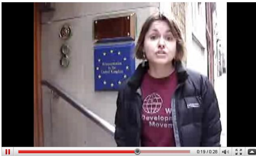
Figure 11: Stills from WDM's WSF Day of Action video in YouTube

The video from the WSF Day of Action shows an unedited shot from the offline event outside the European Commission's offices in London. In the clip a WDM member wearing a WDM t-shirt talks to the camera, explaining that they are there "to protest against the unfair trade deals that Europe are pushing across the developing world". 31 Although the SMOs Friends of the Earth and War on Want are not visible in the shot, the WDM member tells the camera that they are part of the event. The combination of the visual representation of WDM and the verbal reference to the two SMOs yet again demonstrates the contradictory relationship between promoting WDM and