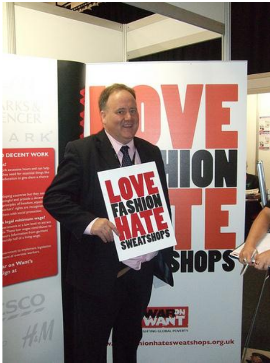
Figure 18: B. Hayes CWU in the Flickr TUC set

the War on Want Flickr profile comprised a total of 1364 photos. These were organised