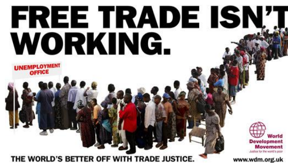
Figure 3: Campaign photo in WDM's trade campaign website www.wdm.org.uk/trade-campaign , WDM, 2009

The campaign as it is introduced in WDM's website is centred round the slogan 'Free trade isn't working' and appropriates one of the slogans of the GJM, 'Capitalism isn't working'. This is a culture-jamming appropriation that mocks the Conservatives' 1979 'Labour isn't working' election poster that reflected discontent at growing unemployment in a time of recession (see e.g. Cammaerts, 2007, and Harold, 2004 for discussions of the intertextual strategies of culture-jamming in counter-cultural movements). In this way, the slogan begins to capture two of WDM's key articulations: (1) diagnostic framing and rearticulation of free trade; and (2) the creation of equivalences.