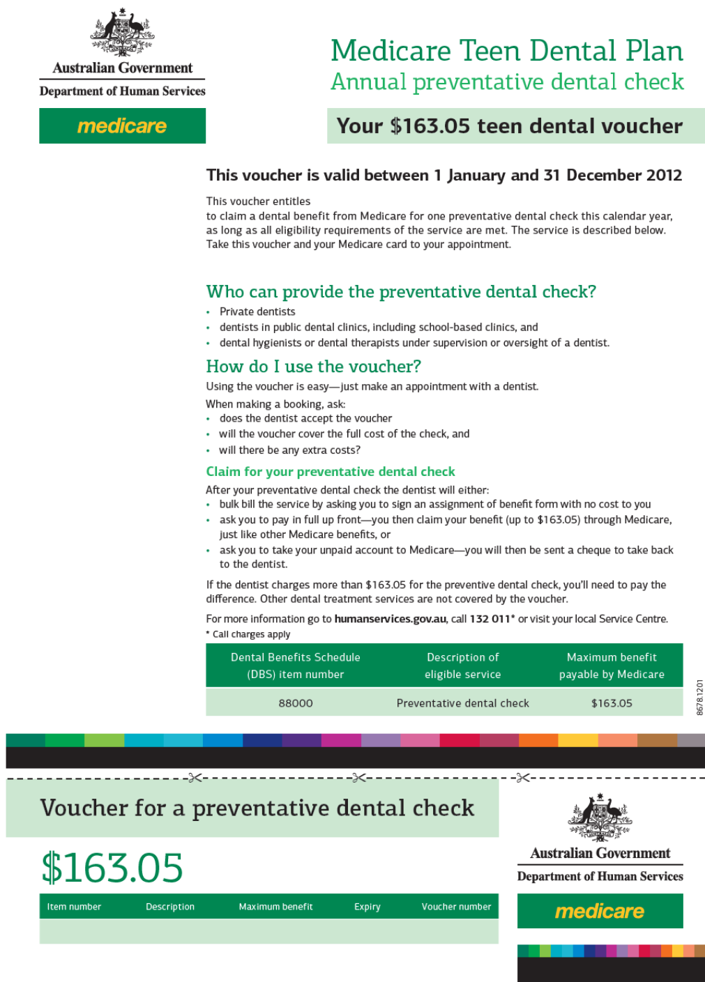
Appendix Figure A1: 2012 MTDP voucher