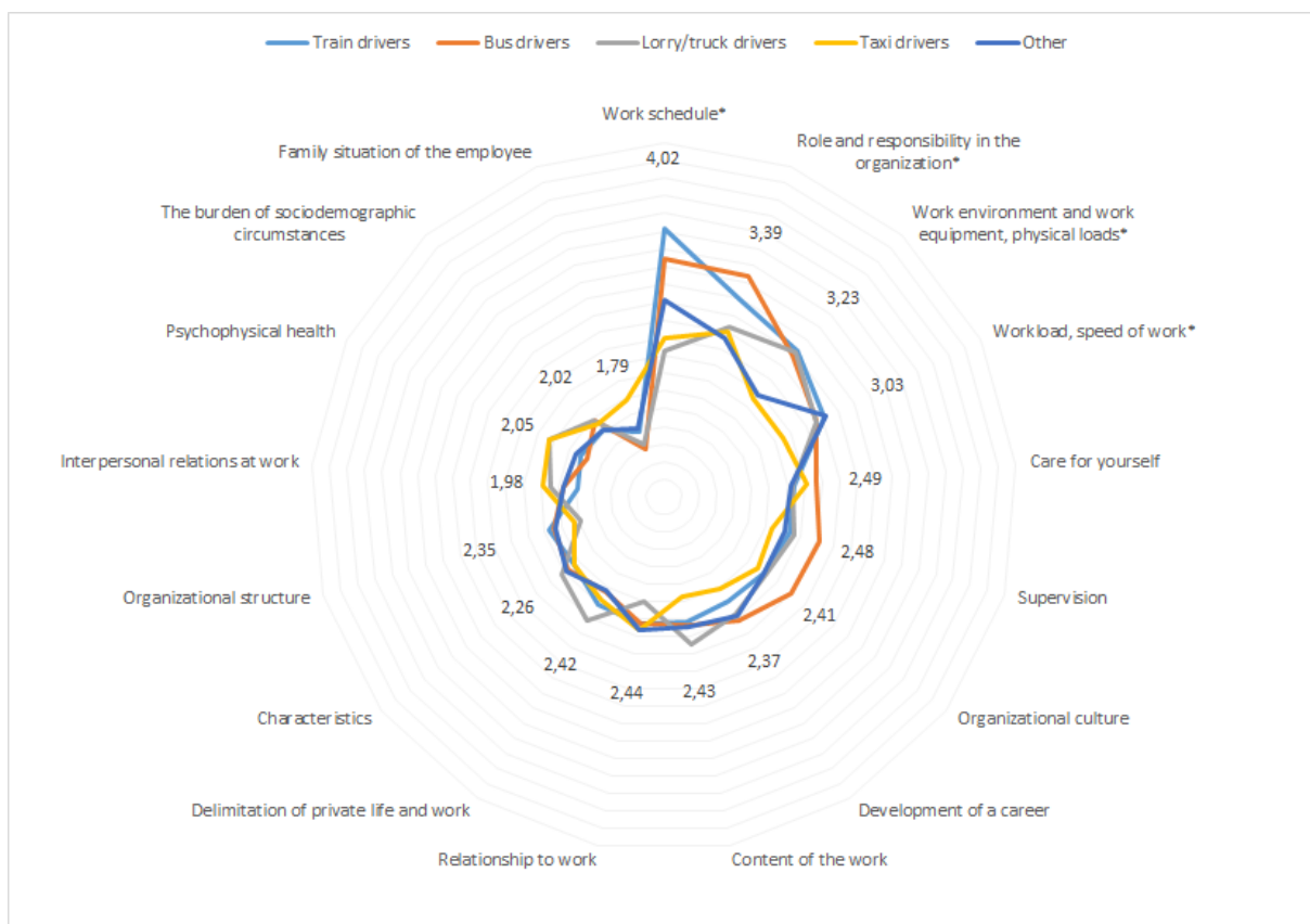
Figure 3 Psychosocial Risk Factors – OPSA

Note: *statistically significant difference at 0.05 level.