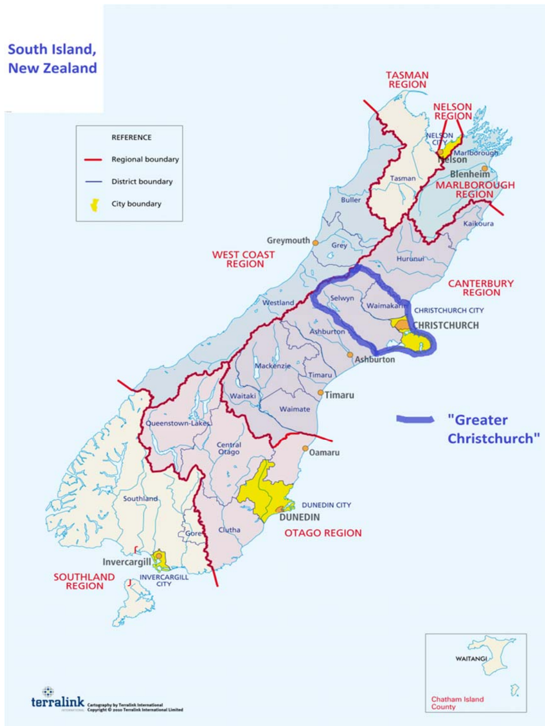
Figure A1. Map of the South Island of New Zealand with Greater Christchurch as the Earthquake ‘Affected Area’

Source: Terralink International ( http://www.lgnz.co.nz/assets/South-Island-PNG.PNG ; Accessed 06/13/2017) with Greater Christchurch added by authors.