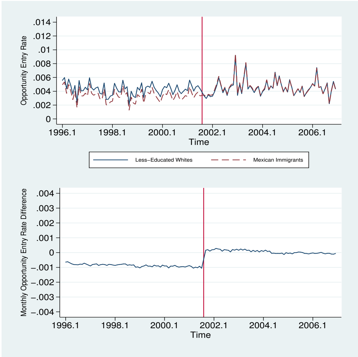
Figure 2: Opportunity Self-Employment Entry Rate Trends by Groups

Notes: The top figure shows regression-adjusted monthly opportunity entry rates by groups (1996-2006). Solid line represents less-educated Whites; dashed line represents Mexican Immigrants. The opportunity entry rates have been regression-adjusted for age, age squared, marital status, years since migration, education, metropolitan dummy, proportion of Hispanics in the MSA, proportion of non-English speakers in the MSA, state monthly unemployment rates, state quarterly income per capita, state and year-month dummies. The bottom figure shows the monthly difference in the regression-adjusted opportunity entry rates between Mexican immigrants and less-educated Whites.