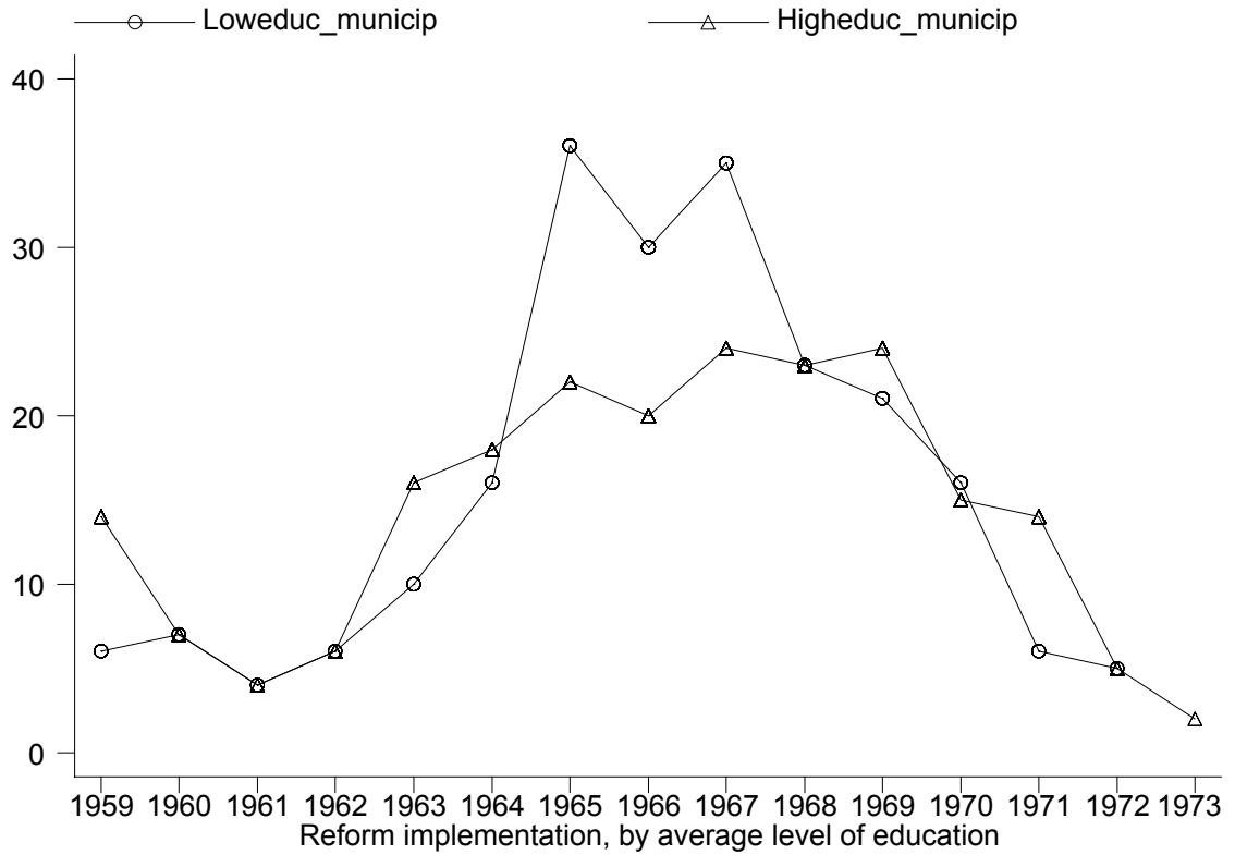
Appendix Figure 3 Reform Implementation in High vs. Low Education Municipalities Based on Average Years Father's of Education in the Municipality, Norway

Low (high) education municipality is calculated as below (above) median education by municipality. Father's average years of education is calculated for each municipality in 1960.