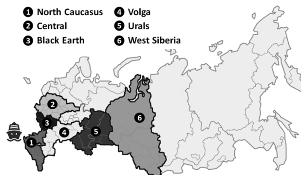
Fig. 1. Map of Russia's grain producing regions.

summarizes similarities and differences between the grain markets in Russia and the USA (for further details see Section 2).