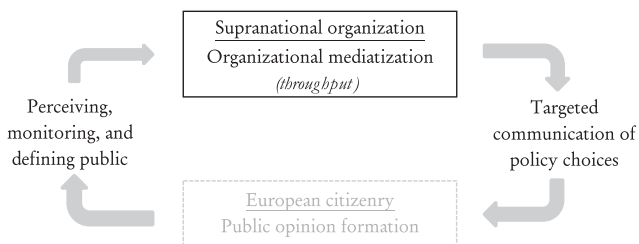
Figure 1. Contours of a procedural model of EU responsiveness.

This model is inspired by theories of organizational mediatization and reputation management developed primarily in the context of national