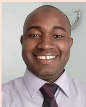
Abdul Bashiru Jibril

Abstract: This paper aims at examining the mediating role of online based-brand community (OBBC) through social media platforms (SMP) given the interplay of consumers' purchasing attitude in a virtual space. To do this, an online survey was used to gauge the views of online consumers so as to establish the relationship between social media usage and consumer-brand loyalty (CBL) via the online based-brand community. A total of 122 social media users affiliated to at least one online brand community took part in the survey. The findings generated through the partial least square and structural equation modelling (PLS-SEM) showed that OBBC on the social media platform positively initiates consumer-brand engagement and user-brand relationship. While SMP indirectly stimulates consumer-brand promise and trust (CBPT), towards CBL via OBBC. For the purpose of brand management and the firm's profitability, this paper offered a conceptual model that depicts a connection between SMP and CBL. The managerial implication of this research was to