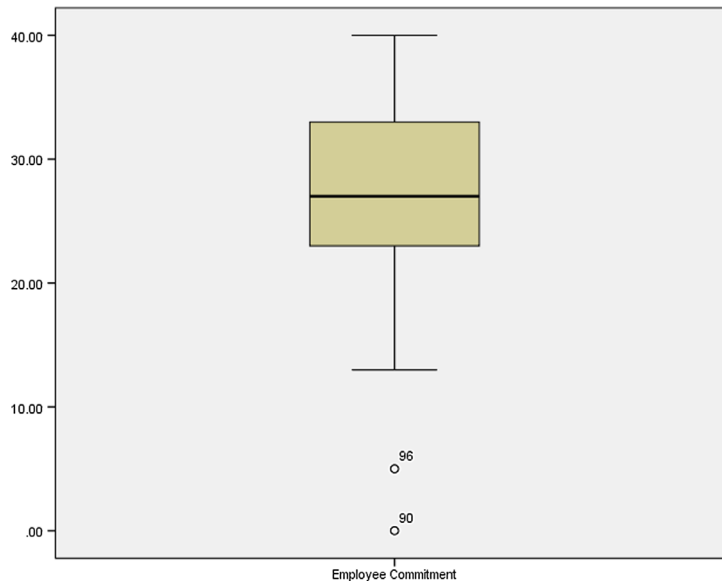
Figure 1. Box plot of normality.

(2015). The control variables were measured by assigning values to their levels as follows: Gender—Male (1); Female (2); Educational level—Basic/secondary (1); Diploma (2); Degree (3); Master’s degree (4); PhD or higher (5); Work experience—Up to 2 years (1); 2–4 years (2); 5–7 years (3); 8–10 years (4); and above 10 years (5).