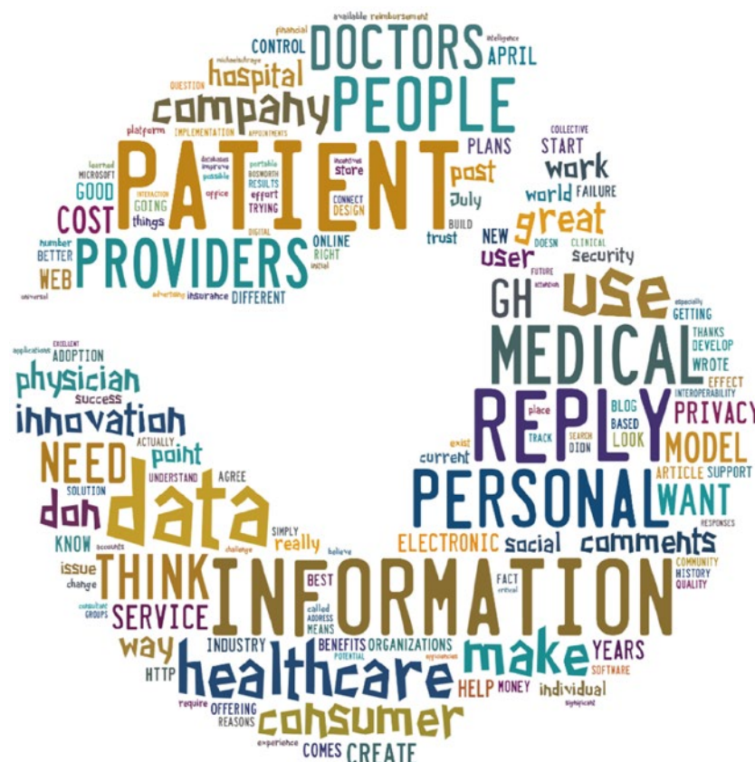
Figure 2. Word cloud of the text in all source files.

If a Martian (or someone who has no prior knowledge about the phenomenon under study) were given the word cloud and asked to write a narrative on the dominant themes to reconstruct the phenomenon, like an archaeologist does with excavated fragments, then some logical research hypotheses may emerge from a closer scrutiny of the word cloud. Ideas are then clustered and a mental map of the phenomenon emerges from the word cloud. The phenomenon of PHRs is described in a mental map shown in Figure 3. Like an archaeologist, we are surfacing the latent story that underlies the use of PHRs. Our reconstructive writing based on the mental map in Figure 3 elucidates the prospects and use of PHRs. The notes based on the key ideas of the write-up are described in the mental map presented in Figure 2 and are presented in the discussion that follows. In developing the narratives through thematic analysis, the synonymous words and phrases were woven together to make meaning for each of the idea clusters. Specific quotations from the blogs that are relevant to each theme are also highlighted for each of the revealed themes.