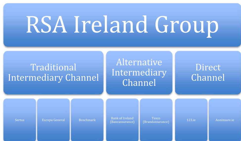
Figure 3. RSA acquired companies and the distribution channels established in the Irish market.

While Europa General ceased to exist and was replaced by RSA branding and underwriting procedures, Sertus, Benchmark and 123.ie had their underwriters replaced by RSA, and policies issued by the underwriting agencies became RSA issued policies. In addition, RSA in Ireland engages in the