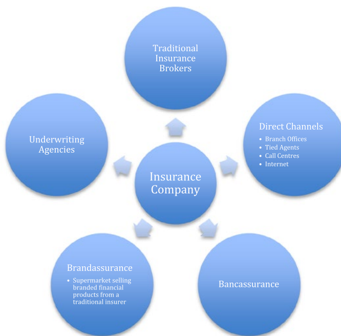
Figure 2. Distribution channels for insurance companies in Ireland.