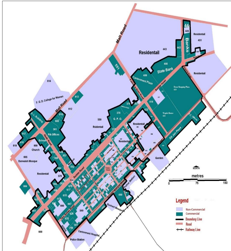
Figure 1: The Central Business District of Peshawar