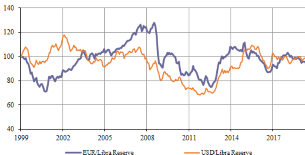
Figure 2: Euro and US dollar exchange rates of the Libra currency basket (1999 - 2019, 1999 = 100, GDP weighting of USD, EUR, JPY and GBP)

Source: Own calculations; data from Datastream.