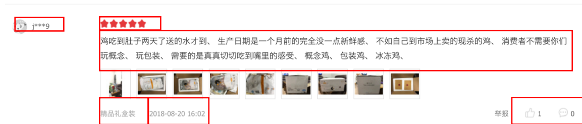
Figure 2 A screenshot of a Chinese review in JD

Firstly, online reviews were collected from a leading e-commerce platform, JD (www.jd.com) and years were spanned from 2017 to 2019 by using a web crawler. The data included several shops which mainly come from JD's own warehouses. To ensure data accuracy, the paper verifies a random selection set of 1000 reviews based on their richness. Figure 2 presents a screenshot of a Chinese review in JD.