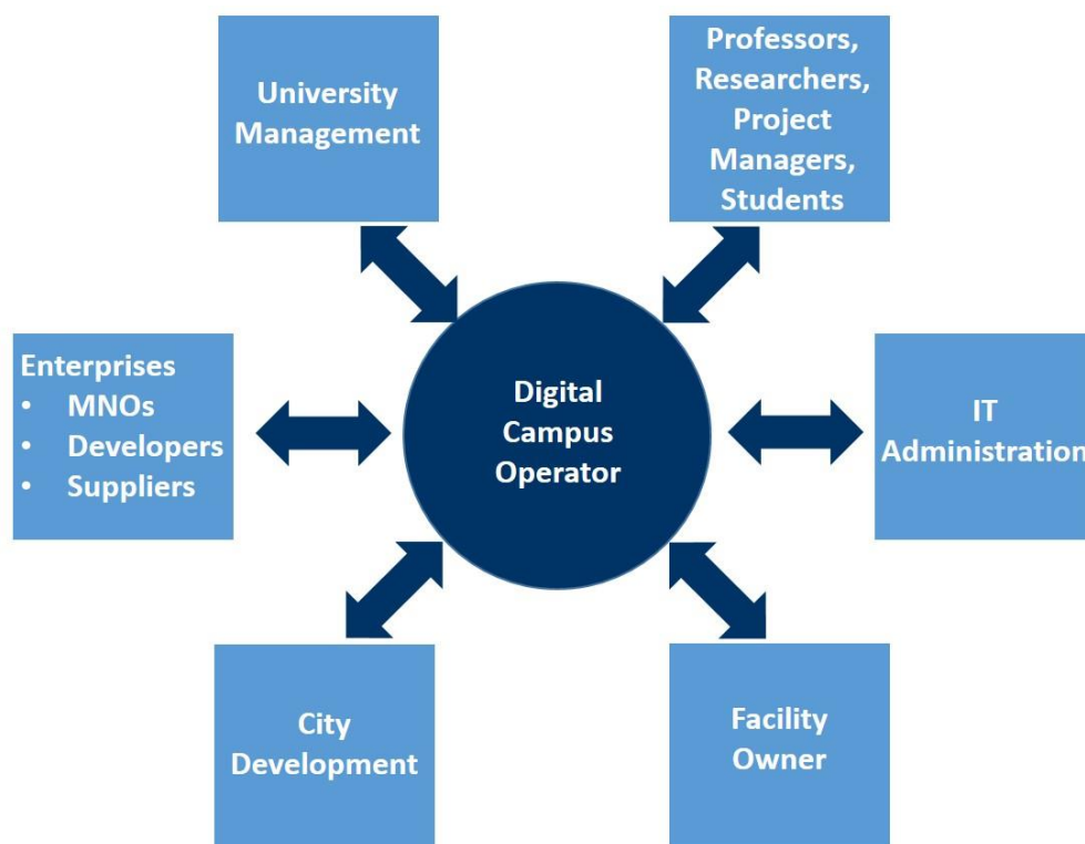
Figure 2. Micro operator ecosystem model for digital campus

Enterprises: Including e.g. MNOs, application developers and suppliers the enterprises have a significant role in realizing the digital campus. Additionally, many of them are contributing the research projects.