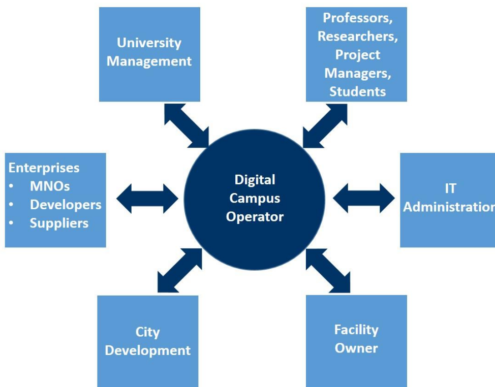
Figure 2. Micro operator ecosystem model for digital campus

Enterprises: Including e.g. MNOs, application developers and suppliers the enterprises have a significant role in realizing the digital campus. Additionally, many of them are contributing the research projects.