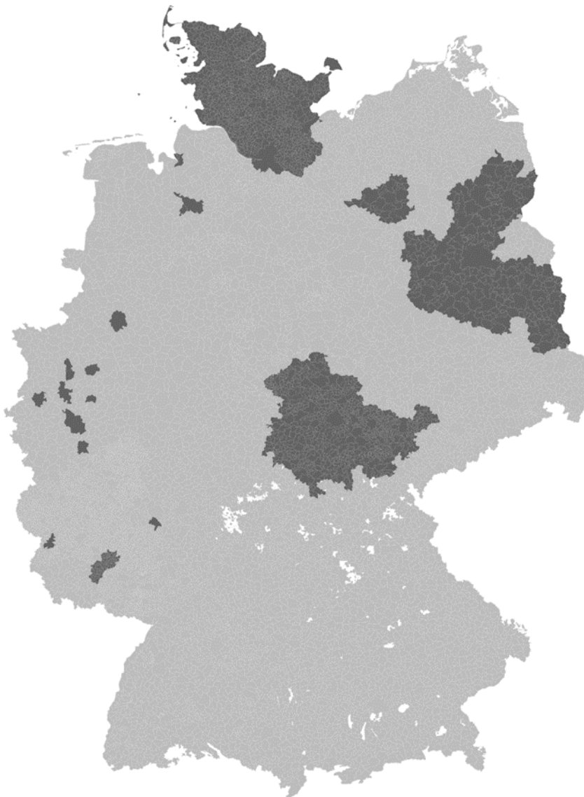
Figure 1: The electronic health card (eHC) coverage in German regions.

Maps based on municipal boundaries at December-31-2017. Dark areas denote localities with eHC . Bright areas denote localities without eHC . White segments denote unincorporated areas.