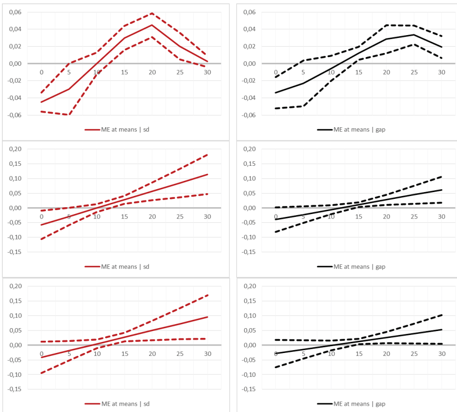
Figure 2: Marginal effects at means evaluated at a given age diversity

Results in row 1 / 2 / 3 are based on the following models: Logit / System GMM with exogenous predictors / System GMM with predetermined production inputs.