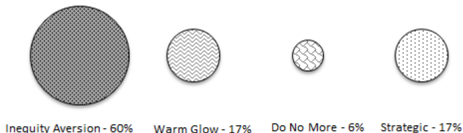
Figure 3. The Four Preference Classes - % captures class-share in data

Figure 3 illustrates the size of the four classes in the data. We have chosen to label each class according to the main behavioural characteristics of each class; the Inequity Averse Altruists class which captures 60 % of observed behaviour, the Warm Glow class which captures 17 %, the Do No More class capturing 6 % and the Strategic class which captures 17 % of observed behaviour. We will now interpret and expand on each of the four classes.